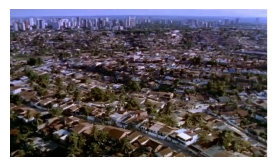
Figure 6: In The little prince's rap against the wicked souls, the aerial long take connects all Brazilian metropolitan regions through their underbelly of poverty

Subúrbio, who is devoted to educational and charitable work. Both characters hail from Camaragibe, a dormitory town in the periphery of Recife, where crime and impunity thrive, but where music offers, as suggested by Brito Gama (2012), the utopia of social change. One of the film's most poignant moment concerns a scene bringing together members of Pernambuco's Faces do Subúrbio and São Paulo's Racionais MC's, two famous bands. The scene starts with Mano Brown and Ice Blue, from Racionais MCs, sitting with friends and enjoying a typical northeastern meal of dried beef and boiled manioc on a roof terrace in Camaragibe. Whilst chatting about the record levels of criminality in São Paulo's Southern Zone, the two look down onto the sprawling favela landscape and identify each of its sections with favelas from that area of São Paulo. This preludes one of the most symbolic "passages" ever shot in Brazilian cinema, consisting of an aerial long take of around two minutes over the never-ending favelas around Recife, to the sound of rap Salve, composed by Edy Rock and Mano Brown, whose lyrics, uttered from the perspective of someone behind bars, salute the populations from favelas from São Paulo, Rio de Janeiro, Belo Horizonte and Brasília. As the names of these communities are called out in an interminable list, space-time realism enabled by the long take offers indexical evidence of the connection of all Brazilian regions through their underbelly of poverty (Figure 6).