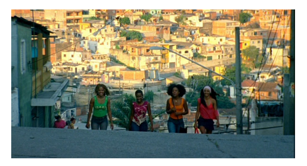
Figure 5: Fictional characters emerge from a real context, in Antônia

step by step how music emerges from daily-life occurrences until it becomes an independent work of art, including lyrics collectively imagined, dance steps rehearsed, backstage production, and the singers progressing from background vocalists to foreground leads.