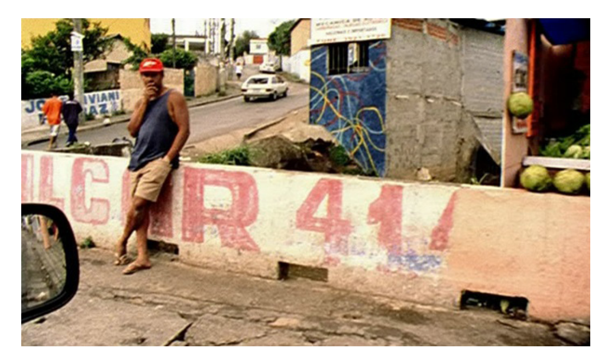
Figure 3: A musical interlude as document in The trespasser

"difficult daily life" (Figure 3). At this point, thanks to the jump cuts, the favela appears as a natural continuation of the noble quarters of the city. The breaking of geographic boundaries caused by the brusque cuts results in striking and entirely recognisable evidence of the state of aesthetic communion among Brazilian urban social classes, despite the enormous economic gulf between them. The way that real life interweaves with fiction here, through a typically intermedial procedure combining film and music, was shockingly enhanced by the fact that Sabotage, the great revelation in the cast of The trespasser , was murdered soon after the opening of the film as a result of an ongoing gang war similar to those described in his songs.