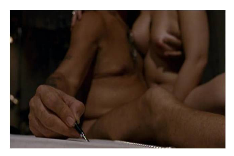
Figure 1: In Delicate Crime, the production of an artwork is concomitant with its reproduction

during which he draws the sketches which are subsequently transferred to the canvas. Both processes (the drawing of the sketches and the actual painting) are shot while in progress, that is, Ehrenberg produced this painting during the actual shooting of the film (Figure 1). Thus, what we see in this scene is the actors leaping out of representation and into a presentational regime in which the production of an artwork is concomitant with its reproduction.