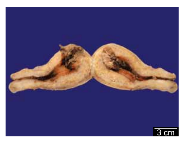
Figure 1 – Longitudinal section of formalinfixed uterus, showing a 3.0 cm polypoid mass at the fundus. Observe a thickened myometrium compatible with multiparity.

fetid mass adherent to the myometrium (Figure 1). Pathological examination detected a fragment of partially necrotic placenta accreta measuring 3.0 cm in the greatest diameter in the uterine fundus, consistent with a hyalinized placental polyp. The histology of the polyp was composed primarily of necrotic and hyalinized placental chorionic villi, but also of areas with preserved trophoblast, which penetrated superficially the myometrium (accretism). An acute polymorphonuclear inflammatory infiltrate and areas of hemorrhage with fibrin were observed along with necrotic areas. The surrounding endometrium showed chronic inflammatory infiltrate with plasma cells and granulation tissue (Figure 2).