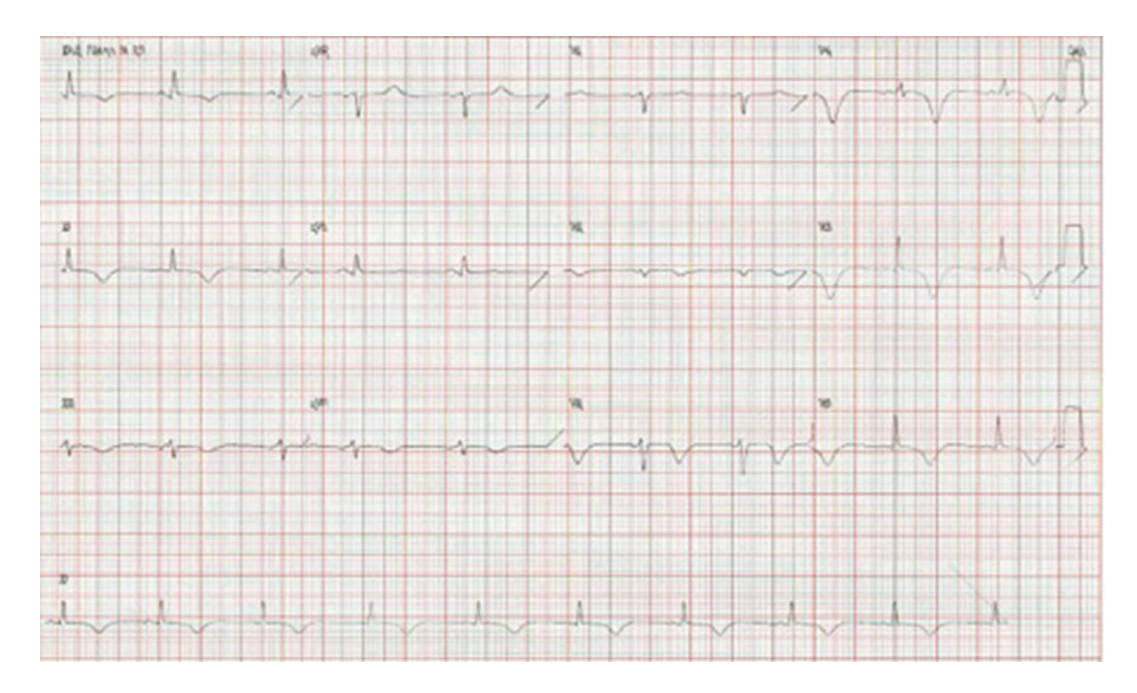
Figure 2. Electrocardiogram, performed on the second day of hospitalization, showing enhancement of the ST wave inversion, mainly in the precordial leads.

Figure 1. Electrocardiogram, performed at admission, showing regular sinus rhythm, cardiac frequency of 75 beats per minute, PRi = 0.12 msec, and inversion of T wave (sign of ischemia) in the inferior and lateral cardiac walls.