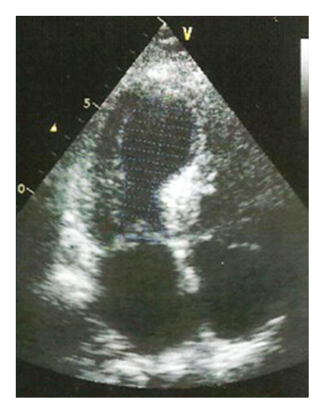
Figure 3. Bidimensional echocardiography, apical 4-chambers focus. Note the systolic shape of the left ventricle with the apical and mid-ventricle akinesia.

The patient was prescribed angiotensin converting enzyme, \beta -blocker, acetylsalicylic acid, a statin and a