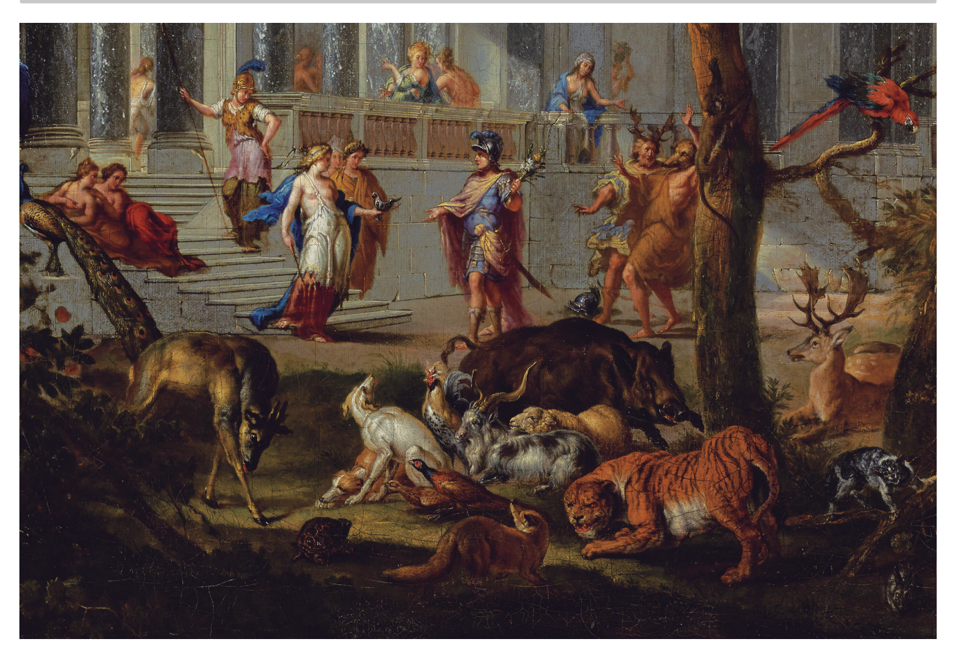
Figure 1. Detail showing some of the animals portrayed by Carl Ruthart in "Ulysses at the Palace of Circe" (1667), a work developed in partnership with Wilhelm Schubert van Ehrenberg. J.P. Getty Museum, Los Angeles.