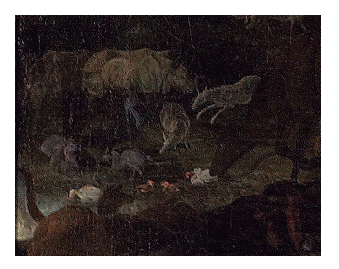
Figure 4. Detail from Carl Ruthart's "Adam naming the Animals" (1686), showing a specimen of Raphus cucullatus near rhinoceroses, unicorns, cassowaries, and a white pelican.

Having called attention since the seventeenth century, the unusual appearance of the dodos would constitute a powerful attraction capable of reinforcing a fame destined to grow more and more over time. Irrespective of any other consideration, Raphus cucullatus would be the subject of an impressive number of publications de-