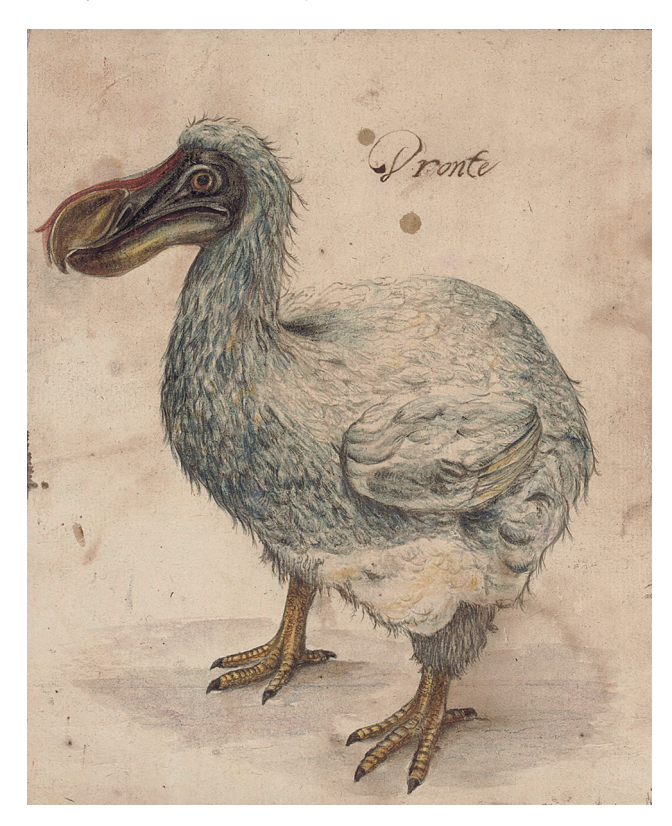
Figure 10. The "dronte", Raphus cucullatus . Drawing with no author or date offered for sale by Christie's, London, on July 9, 2009.

oil on canvas is considered a painting by Carl Andreas Ruthart completed around 1680<sup>9</sup>. Like other artists of the time, the author relies on the classic Genesis passage to portray an authentic multitude of animals being directed to the ark by Noah and his sons. In the background landscape of the upper left quadrant, a couple of dodos climb the boarding ramp in the company of quadrupeds such as unicorns, camels, and elephants (Figs. 5 and 6).