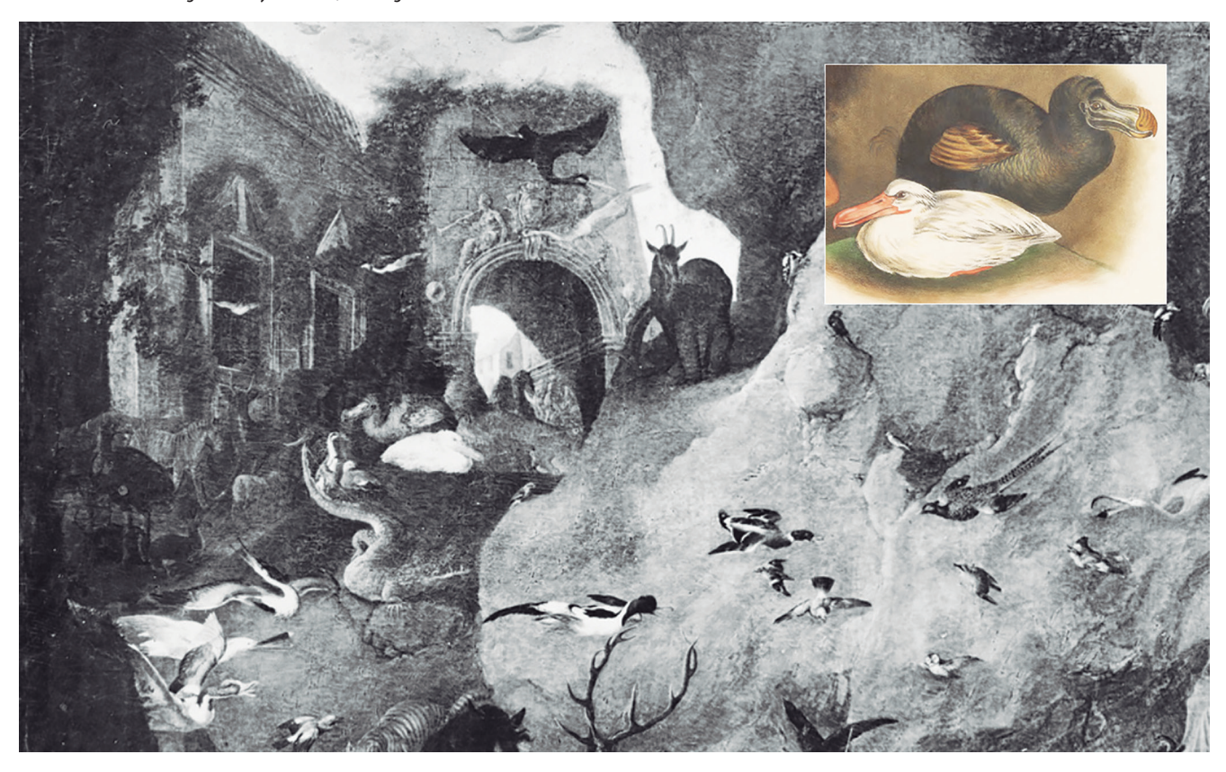
Figure 2. Detail from Carl Ruthart's "The Cave of Circe" (1666), showing an exemplar of Raphus cucullatus alongside a white pelican. In the right highlight, the plate published by Biedermann (1898) reproducing a specular version of the original painting. Belonging to the Dresden Königliche Gemäldegalerie, this work was to be destroyed during the February 1945 bombing.