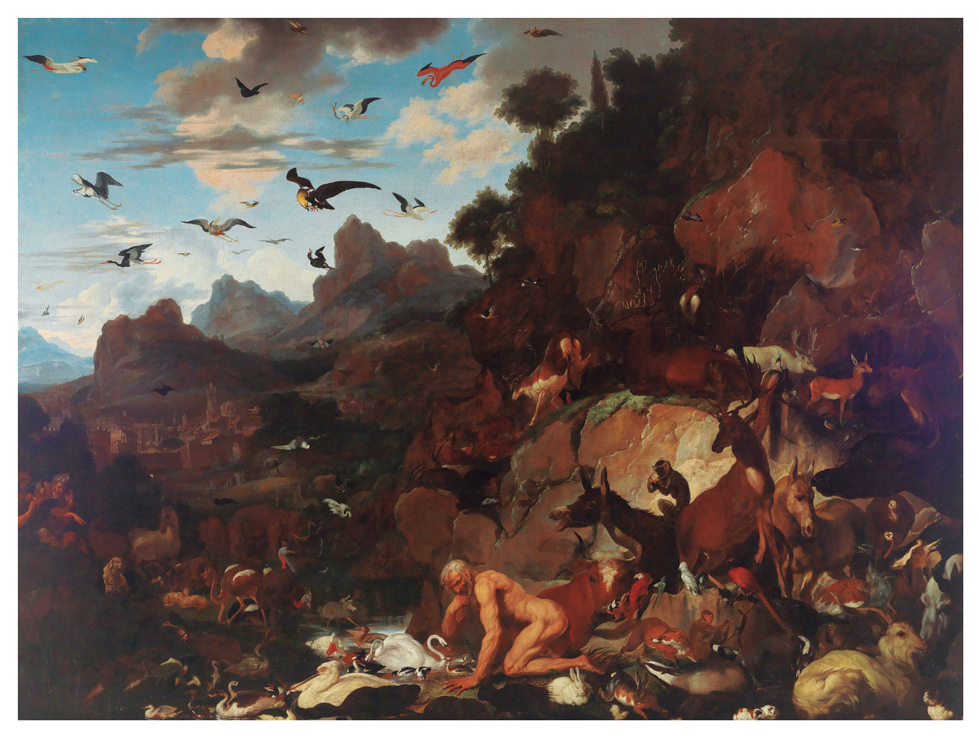
Figure 8. "Nebuchadnezzar's madness" by Carl Ruthart (ca. 1680). Offered at public auction by Dorotheum, Vienna, on April 24, 2018.