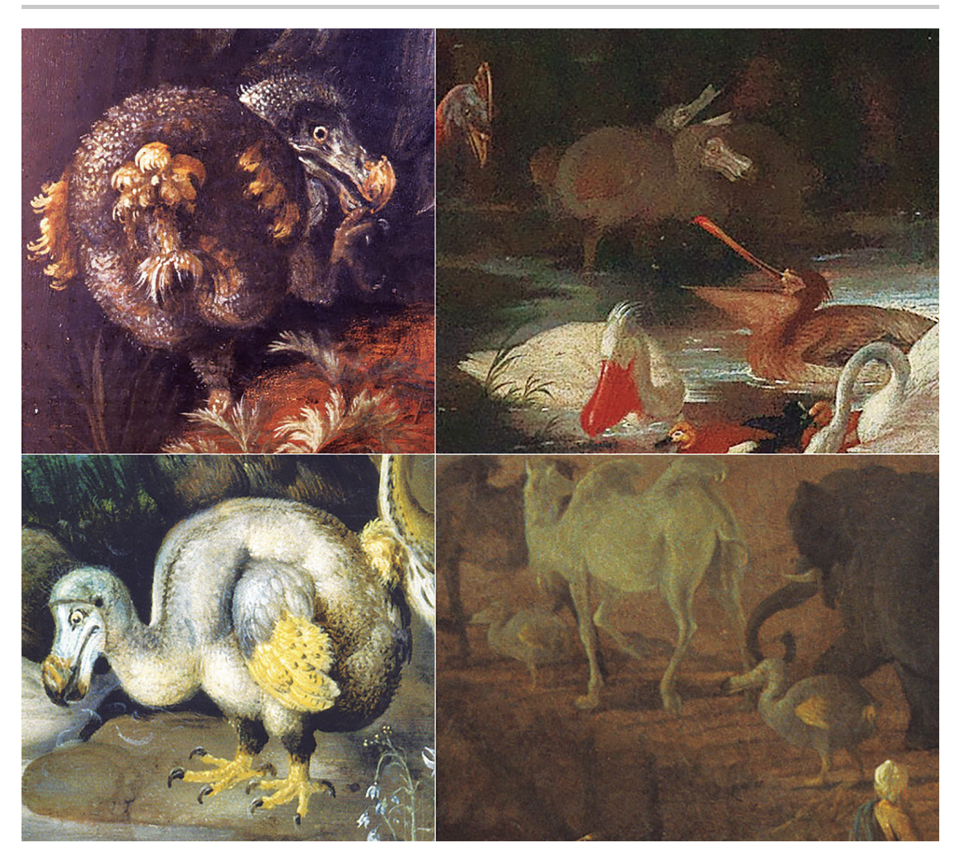
Figure 11. From left to right, top to bottom: specimens of Raphus cucullatus depicted in Roelandt Savery's "Landscape with Animals" ( ca. 1629), Carl Ruthart's "Nebuchadnezzar's madness" ( ca. 1680), Roelandt Savery's "Landscape with Birds" (1628) and Carl Ruthart's "The Entry of the Animals into Noah's Ark" ( ca. 1680). Zoological Society of London; Dorotheum, Vienna; Kunsthistrorisches Museum, Vienna, and Staatsgalerie Stuttgart.

On February 25, 2015, the Nagel Auktionen of Stuttgart offered for sale a 90 × 112 cm oil on canvas attributed to "Carl Borromeo Andreas Ruthart Studio". With no origin and date specified, this "The Entry of Animals into Noah's Ark" is just a smaller variant of the previous painting<sup>10</sup>. Like the original, two dodos can also be seen climbing the boarding ramp along with unicorns, camels, rhinoceroses and elephants. The painting is of much lower quality and much less detailed, reinforcing the assumption that it is the work of some follower or apprentice (Fig. 7).