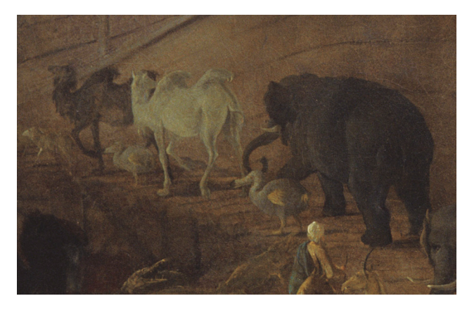
Figure 6. Detail from Carl Ruthart's "The Entry of the Animals into Noah's Ark" ( ca. 1680), showing two specimens of Raphus cucullatus climbing the boarding ramp with unicorns, rams, camels, and elephants. Staatsgalerie Stuttgart.

images that seem to have escaped the scrutiny of experts, all attributed or related to the German painter Carl Borromäus Andreas Ruthart.