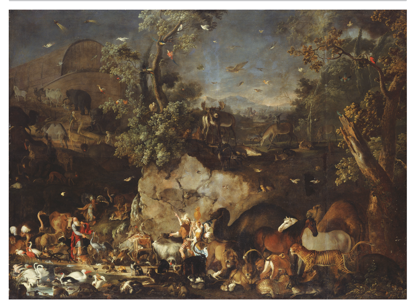
Figure 5. "The Entry of the Animals into Noah's Ark" by Carl Ruthart (ca. 1680). Staatsgalerie Stuttgart.