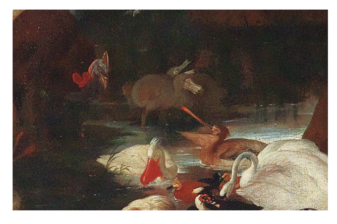
Figure 9. Detail from Carl Ruthart's "Nebuchadnezzar's madness" ( ca. 1680), showing two specimens of Raphus cucullatus wading through the shallow waters of a pond. Dorotheum, Vienna.

oil on canvas is considered a painting by Carl Andreas Ruthart completed around 1680<sup>9</sup>. Like other artists of the time, the author relies on the classic Genesis passage to portray an authentic multitude of animals being directed to the ark by Noah and his sons. In the background landscape of the upper left quadrant, a couple of dodos climb the boarding ramp in the company of quadrupeds such as unicorns, camels, and elephants (Figs. 5 and 6).