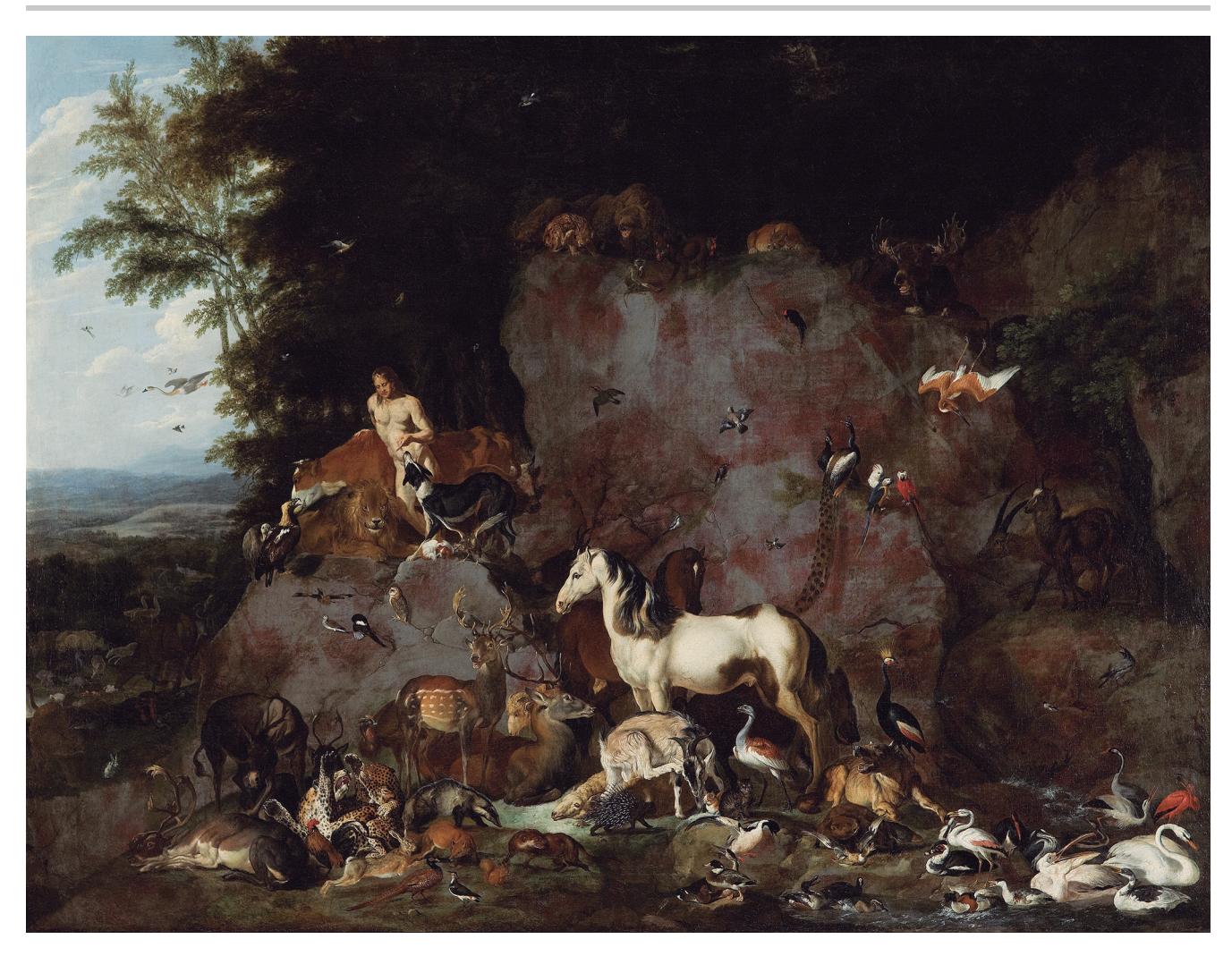
Figure 3. "Adam naming the Animals" by Carl Ruthart (1686).