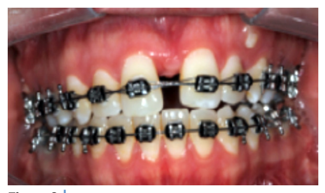
Figure 6 Postoperative period at 3 months.

The impacted canine was included in the arch by orthodontic traction, using a gold-plated chain (Morelli Ortodontia<sup>®</sup> Sorocaba, Brazil) bonded