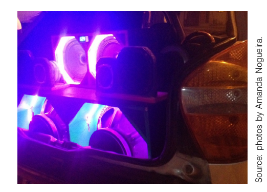
Figure 8: Car prepared to play music which was always present, being an intense factor.

We opted for semi-structured interviews and semi-directive questions, which allowed us to discuss controversial points we encountered during our monitoring of the family on the field. We followed a minimum of standardization on the interviews, to the compare answers of different participants later.