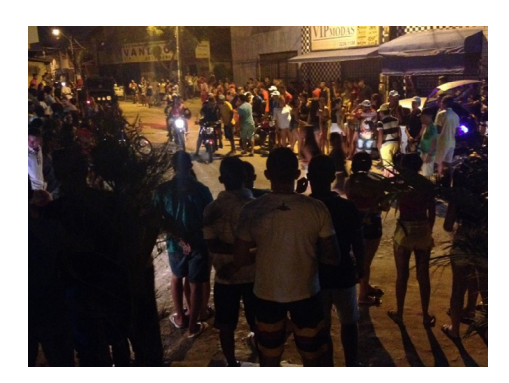
Figure 7: Record of one of the meetings of the family at the Praça do Alecrim.