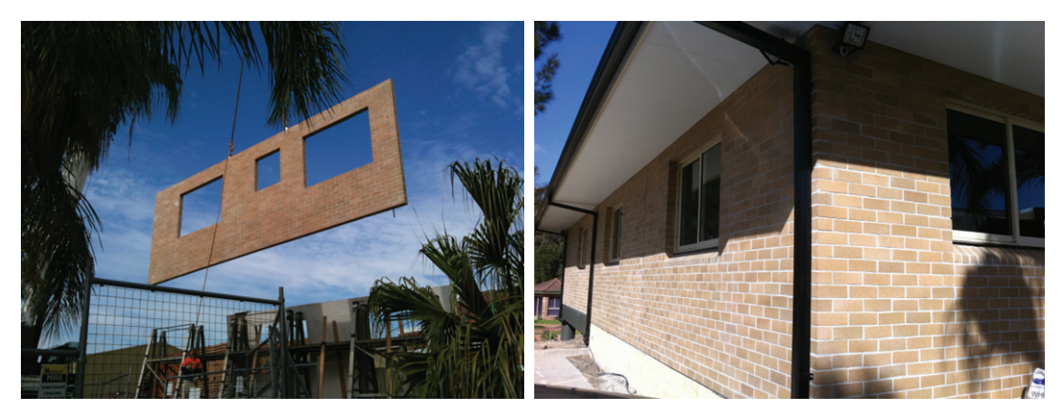
Figure 5. Prefabricated housing system.

quality product. This could include more effective education and training programs for designers, builders and tradesmen; the development of techniques and systems which overcome the inherent low tensile strength of masonry; innovations in laying techniques through the use of lightweight bricks and blocks of increased size to increase the speed of construction; the development of semi-automated laying systems; the use of thin bed mortars and/or dry stack modular systems etc.