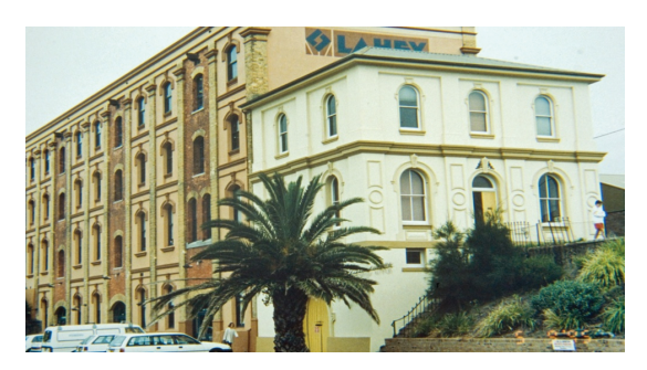
Figure 2. Traditional loadbearing construction.

floor space, but this method of design persisted in Australia until as recently as the nineteen sixties.