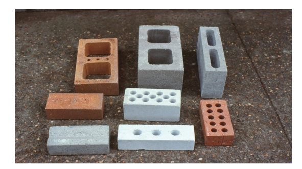
Figure 1. Typical Australian masonry units.

In the twentieth century, the advent of Portland cement resulted in the emergence of additional masonry materials in the form of concrete bricks and blocks, calcium silicate bricks, and most recently, autoclaved aerated concrete units. This, combined with further advances in brick making technology, has resulted in a wide ranging set of economical masonry products being available to the consumer (typical Australian masonry units are shown in Figure 1). These changes have been accompanied by progressive rationalization of the industry, with a large number of small producers being replaced by a small number of large companies often producing the full range of clay and concrete products servicing a country which has one of the highest per capita uses of masonry in the world, approximately three times that of the USA (LAWRENCE, 2008).