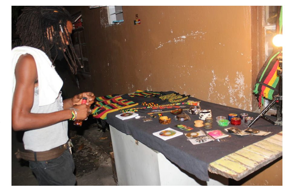
FIGURE 4 Young Rastaman selling his arts and crafts beside an I-tal Rastaurant

My Lord! It is most naturally dat Jah created everyting, including dis yah likkle island dem a call Jamaica. Dis island, however, is not di place weh wi belong. Wi belong in Ethiopia, Africa, and dat is why I n I a deal strictly wid Repatriation, yuh 'ear?