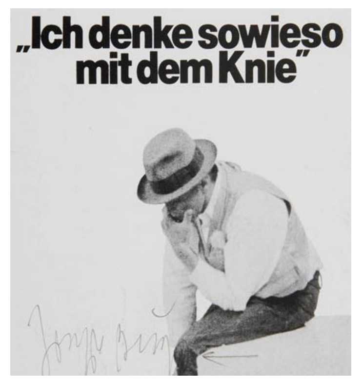
FIGURE 2 – Poster (detail) of J. Beuys (1977)

The proposal of the Fluxus Movement was the production of living art, in flux. The performance was, therefore, naturally a gesture very cultivated. In 2010, Farocki would perform a homage to Tomas Schmit (1943-2006), one of the German artists of the Fluxus group. Transfusion. Variations of opus 1 by Tomas Schmit (Umgießen. Variationen zu Opus 1 von Tomas Schmit , 2010) would be a video installation, composed of seven electronic panels arranged in circuit, reinterpreting the performance of Schmit in Cycle for water buckets (or bottles) (1963) ( Zyklus for water-pails [or bottles] ). In Schmit's performance, the interpreter remains in a circle of 10 to 30 buckets or bottles of water ("of different types, if possible", as endorsed Schmit). One full of water; the other ones empty. The interpreter then dumps the full bottle, emptying it to fill the