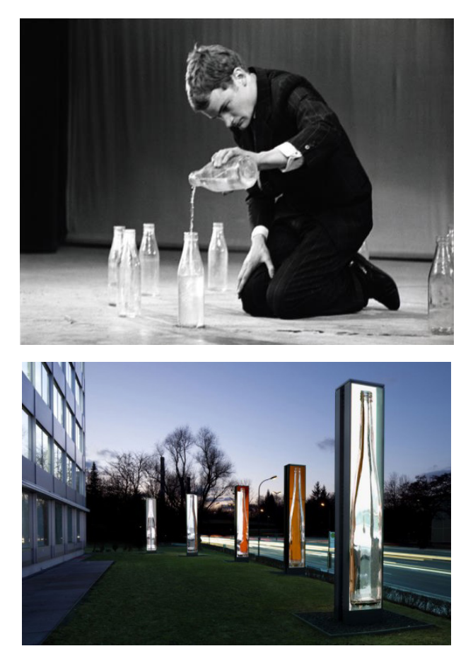
FIGURE 3 – Performance of Schmit in Amsterdam (1963) and video installation of Farocki (Transfusion, 2010)

next one to the right. He repeats this process with the bottle recently filled and the next empty bottle on the right – moving in circles, until all the water evaporated or spilled. The performance was a demonstration of the transindividuation operation, which means we are in levels that tend to a metastability from tensions, overflow, inexorable variables in the process (Figure 3). However, in the installation of 2010, Farocki introduced a robotic hand performing; and, in the synopsis of his work, he alludes: "The act prevents the symbolism [...]. It was similar to the simplicity of a play of Beckett, in its simplicity and concreteness. Even in the regularity of the performance, there was an evolution; the anti-action was, by itself, an end" (Farocki, 2010).