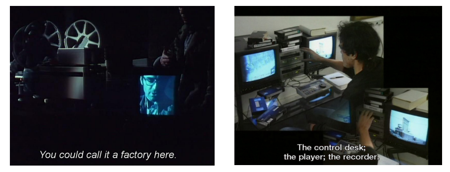
FIGURE 1 - The world crosses the film (and vice versa) in Numéro Deux and in Interface

Twenty years after Numéro Deux, in 1995, Farocki would be in front of his camera and film equipment the same way Godard did. The film Interface composes the vicissitudes of the crossing or intersection of the images of the world that cross the cinema. Farocki also led the camera to his own editing room. And now we see televisions, handheld camera, displays, controls, videotapes at the table. From a short auto-filmography, we see properly cinematic acts by the filmmaker, for example, the act of managing images, cutting the film, holding the camera in front of a screen, putting it on the shoulder, shooting the street through the window etc., which recalls the images of the political act of the amateur cameraman Paul Cozighian, exhibited on Videograms of a Revolution (1992); at the same time, we see images of the world: images of money out of the pocket, images of a revolution, of a factory, a studio, a lab; of books, machines, among others. We are fully immersed in a place where the potential of transverse influence is taken very seriously regarding the images of the world, in their uncontrollable contingency that crosses the editing room, and where the operator intercepts and is intercepted by them, trying to give a meaning to them, even if it is temporary, limited. (Figure 1)