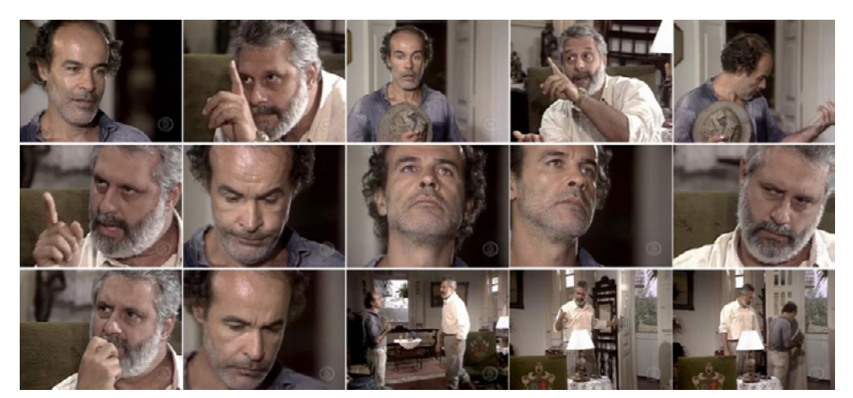
<sup>16</sup>Globo TV owns the copyright of the images used in this article. According to guidelines by Globo Universidade, in Figures 3 and 4 appears the watermark of the TV station and of Viva (channel Globosat), respectively.

rides a black goat that flies and urinates all over the plantings, increasing their productivity. The legend is not mocked by Inocêncio. Illiterate and labeled as gullible by other plot characters, Tião refers to the intercession of the coronel so that he is lectured by him on how to raise a Cramulhão and, thus, have, in his words, "a little mouthful of land". This is the scene motto of chapter 25, whose frames are highlighted in Figure 3<sup>16</sup>.