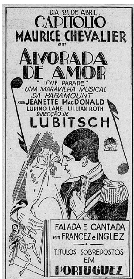
FIGURE 2 – Ad of the subtitled copy of The Love Parade (O Paiz, 1930b: 10)

While in the foreign-language versions and in the dubbed films there was the replacement of one language for another, the third alternative experienced in 1930 remained the customary offering of verbal information in the form of written information. However, this was no longer about replacing dialogs for the written text nor inserting cards between images, but to overlap them. Instead of exchanging information (verbal, in English) by another (written in Portuguese) or switch them (text / image and sound / text / image and sound), they began to be offered simultaneously .