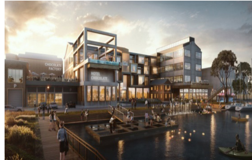
Figure 9 – project Hongqi Zhen