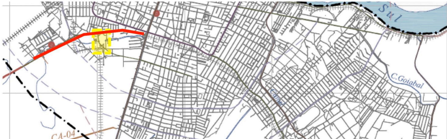
Figure 6 - Urban Mobility Map. In red ECS-3, yellow ZR -2, Burn Plant.