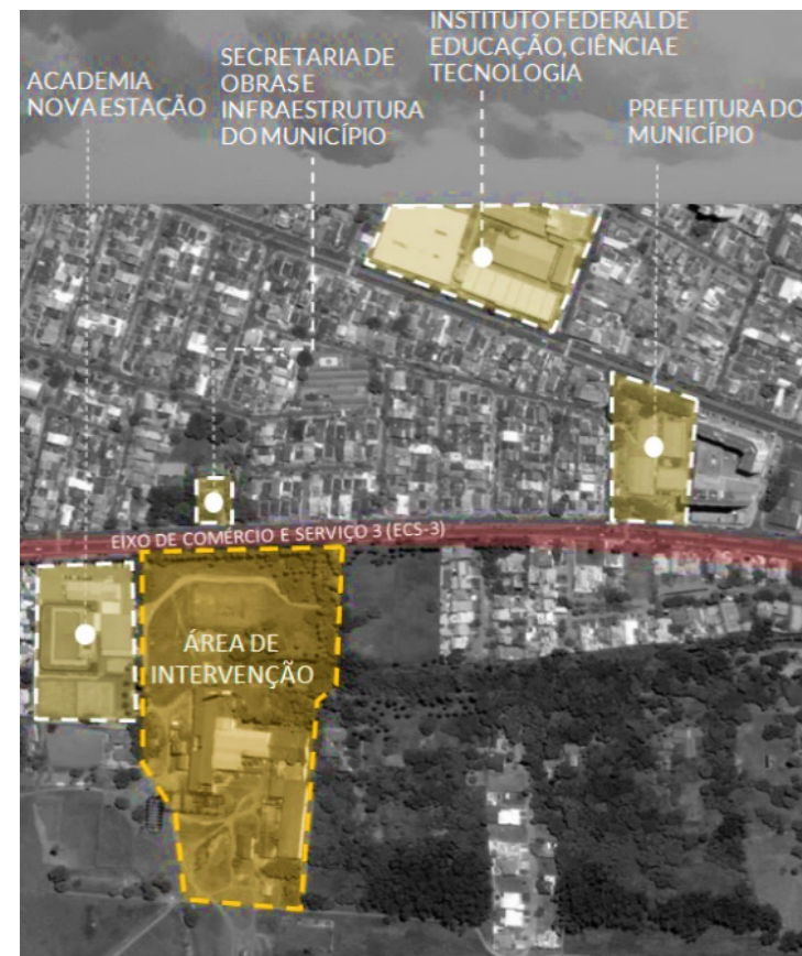
Figure 2 - Layout of the Burned Plant and Avenida Dr. Nilo Peçanha (Trade axis and Service 3 - ECS -3).

situated on an avenue of extreme importance (Avenida Dr. Nilo Peçanha), which is also a Trade and Services Axis 3 (ECS-3), on a gleba where the price of the square meter is one of the highest in the city.