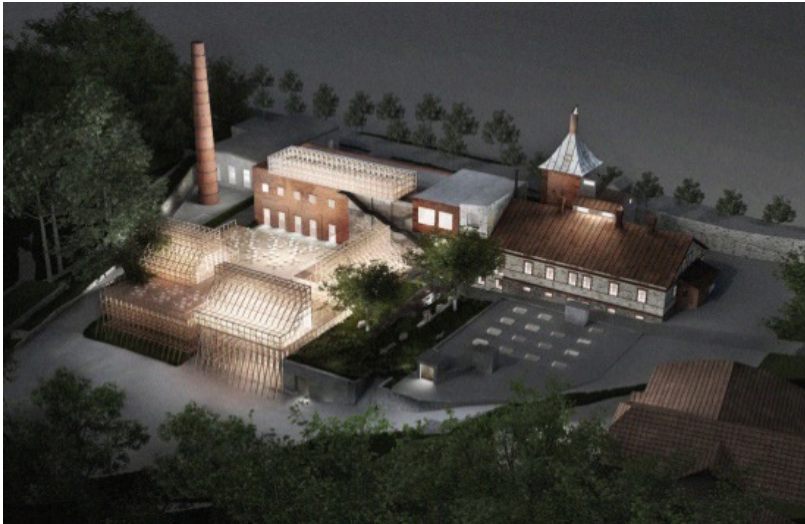
Figure 8-Project Cesis Brewing.