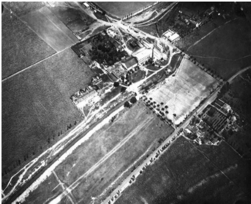
Figure 3 - Aerial view of the Burn plant, 1880. Highlighted in red the Avenue Dr. Nilo Peçanha.

The methodological procedure of this work focuses on: (a) in the bibliographic review on the city of Campos dos Goytacazes, a sugar-alcohol period to date; (b) in the object of study: the Burn plant; and (c) Documentary analysis.