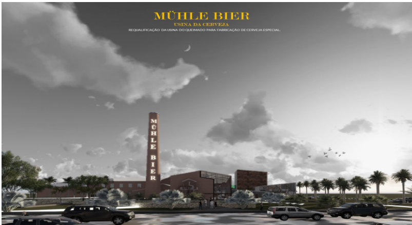
Figure 10 – Burn Plant requalification project for special beer making.

hardly make an intervention to this degree. In the cases mentioned above, for example, they could happen from the application of the Instrument Transfer of the Right to Build. In order to harmonize with the Right of Preemption, interventions of a social, cultural and environmental nature are susceptible, where the retrofit technique would be used with less investment in modern and technological elements.