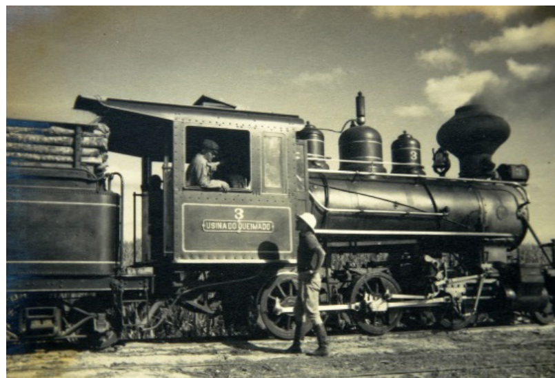
Figure 5 – Locomotive No. 3 of the Burned Plant.

For agroindustry, the emergence of good and bad phases have always taken turns without separatism of a political or social nature. It was not the Republic or the change of century or even the disappearance of slavery that would create different stages. For sugar factories everything was a continuing of struggles, grandeurs, misery and crises. Here and there, the owners moved. There and there, factory closed. For many former propitiarians,