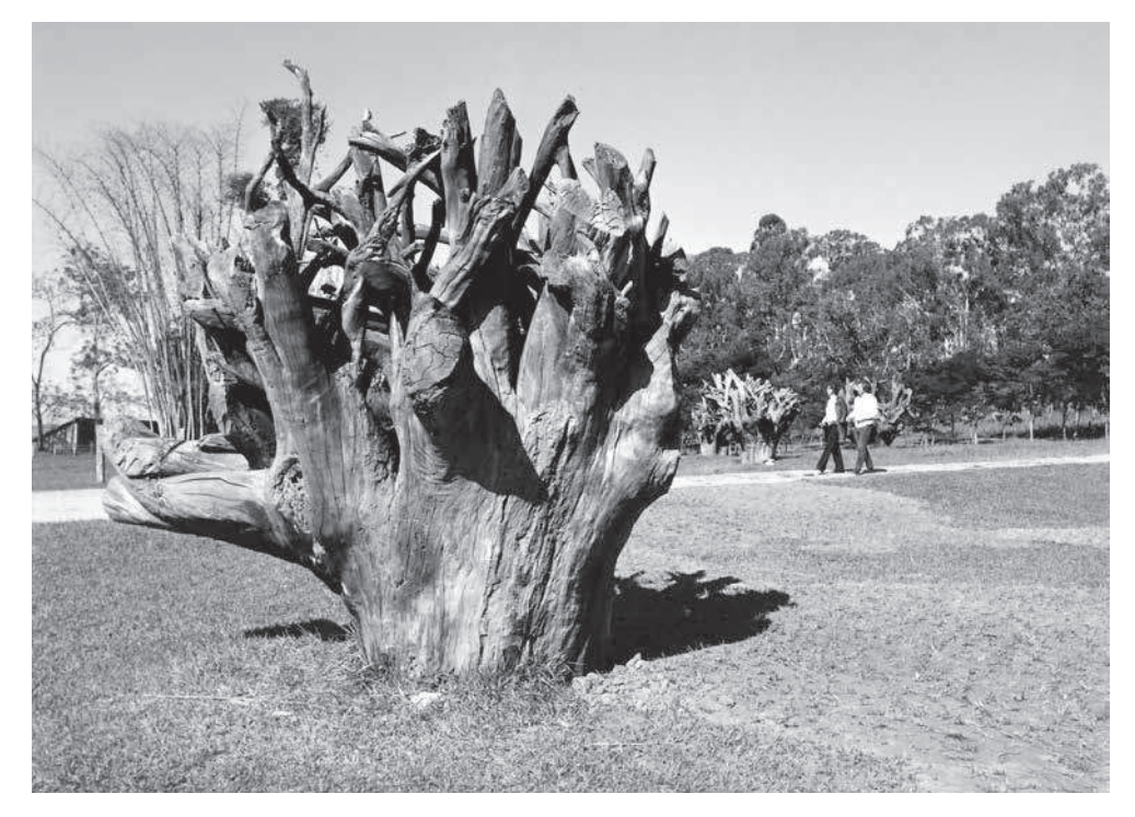
Picture 21 Olívio Gomes Family residence, Vale do Paraíba, São José dos Campos, SP, c. 1970.