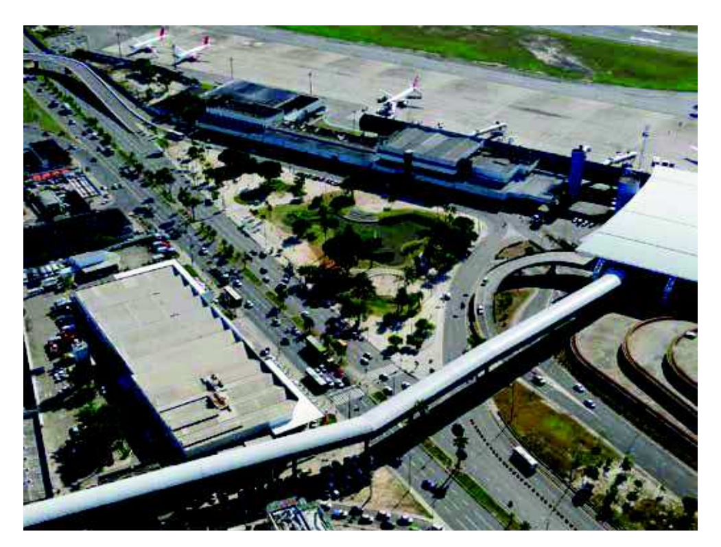
Picture 13 Ministro Salgado Filho Square, Recife, PE.