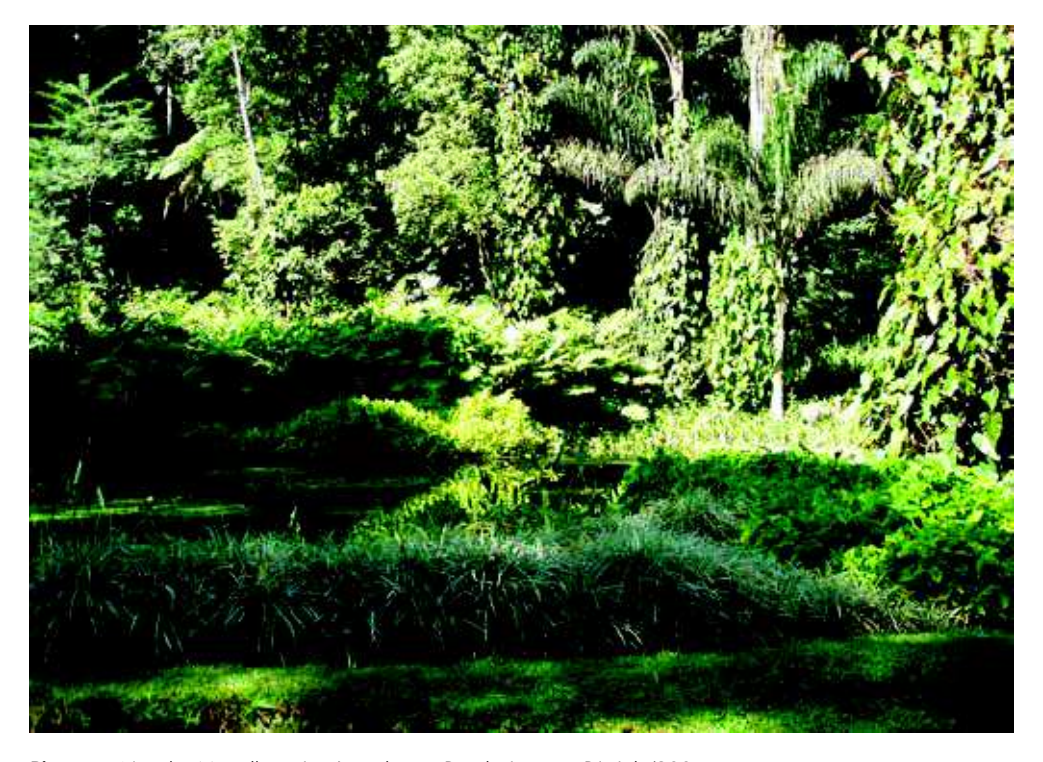
Picture 1 Nininha Magalhães Lins' residence, Rio de Janeiro, RJ, July/2005.

In Nininha Magalhães Lins' project, in Rio de Janeiro, one can observe the creation of landscapes that seduce the human eye by means of the subtle manipulation of nature, which dilutes itself in the pristine background (pictures 1, 2 and 3). A permanent feature of his works was the dialogue with the place, sometimes agreeing and connecting it with the landscape, other times carefully denying the surroundings, seeking aesthetic - functional solutions to make the location pleasurable. (MARX, 2004).