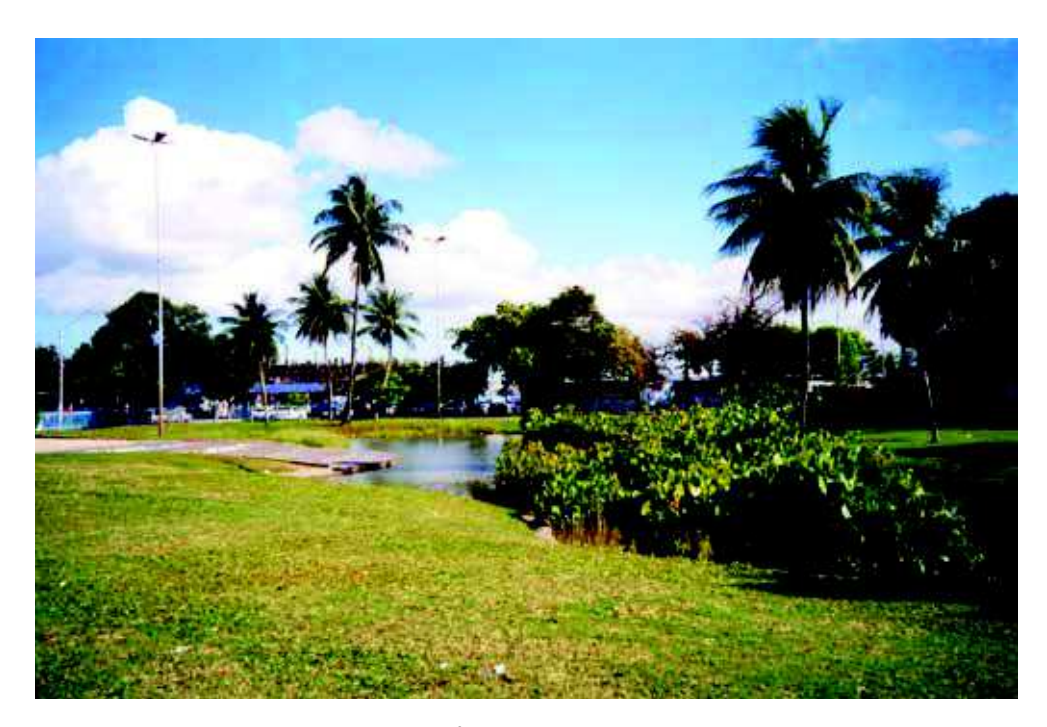
Picture 16 Ministro Salgado Filho Square, Recife, PE. Photo: Silvio Soares Macedo, 2014. Quapá collection.