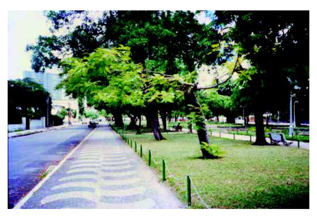
Picture 9 Casa Forte Square, Recife, PE. Photo: Ana Carolina Magalhães, 1996. Quapá collection.