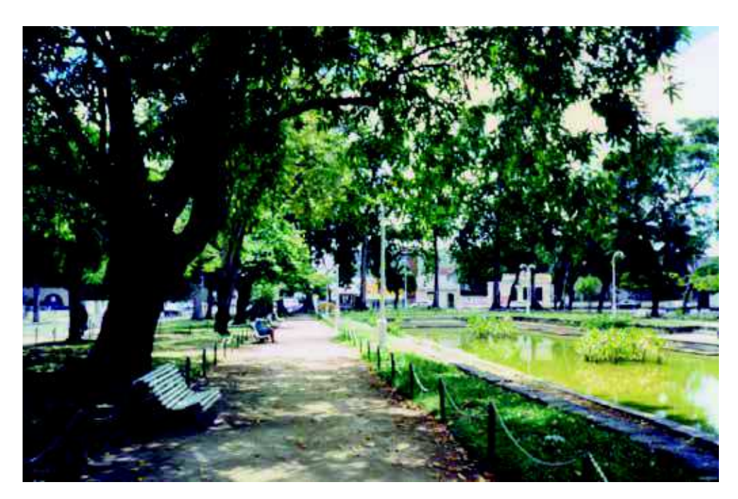
Picture 8 Casa Forte Square, Recife, PE. Photo: Ana Carolina Magalhães, 1996. Quapá collection.