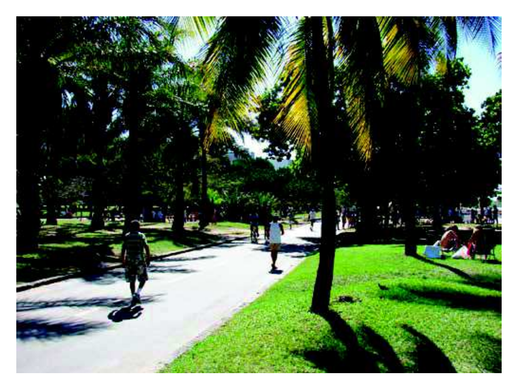
Picture 18 Flamengo Park, Rio de Janeiro, RJ, 2008.