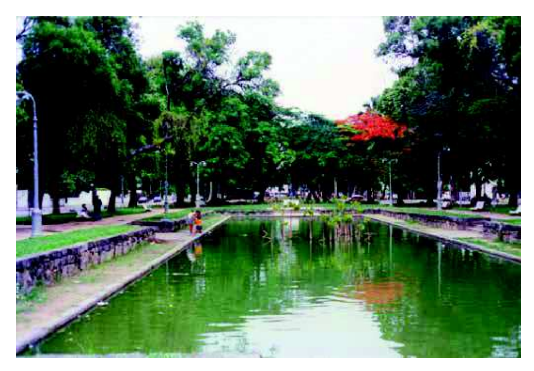
Picture 10 Casa Forte Square, Recife, PE. 1997.