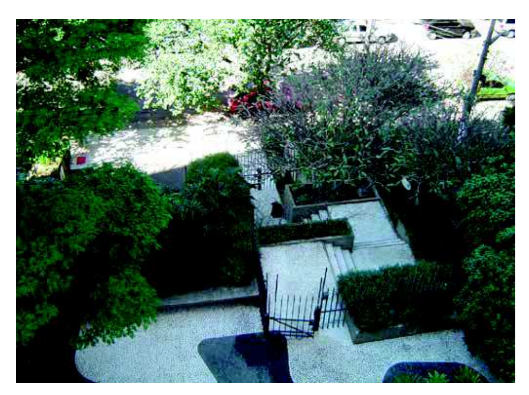
Picture 5 Macunaíma Building, São Paulo, SP, 2005.