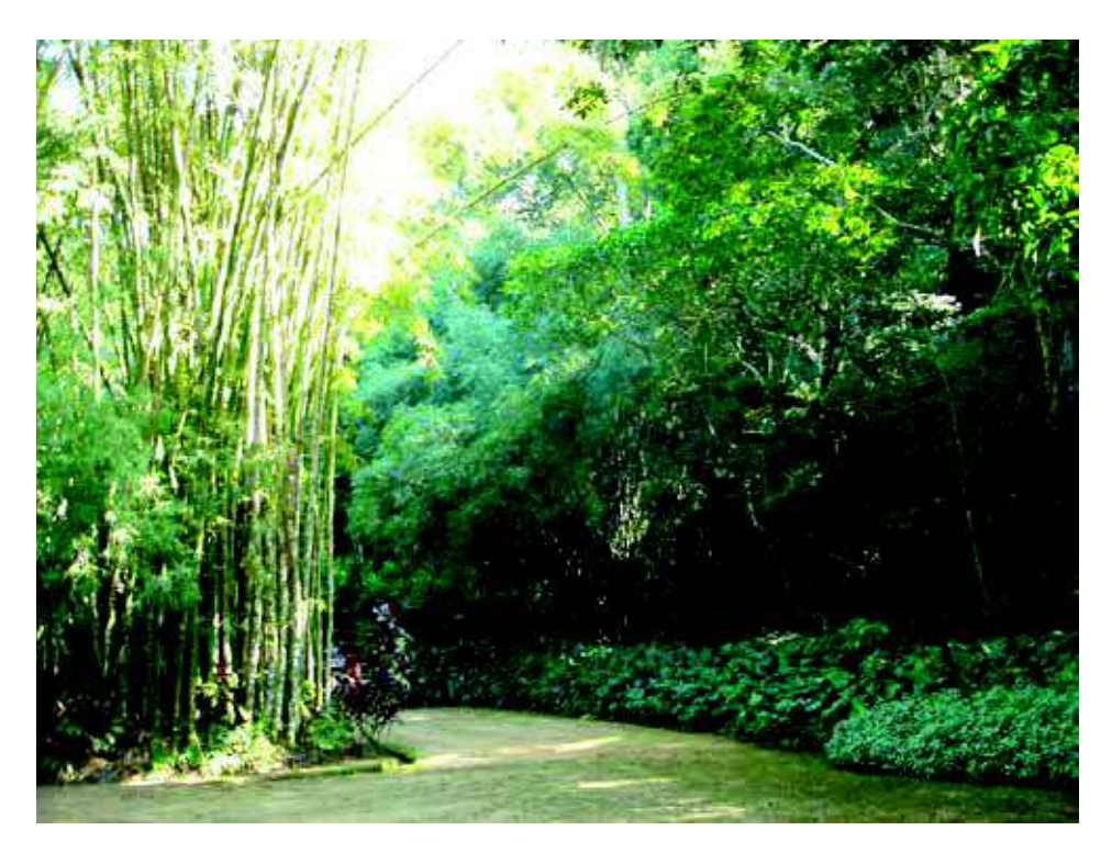
Picture 2 Nininha Magalhães Lins' residence, Rio de Janeiro, RJ, 2005.