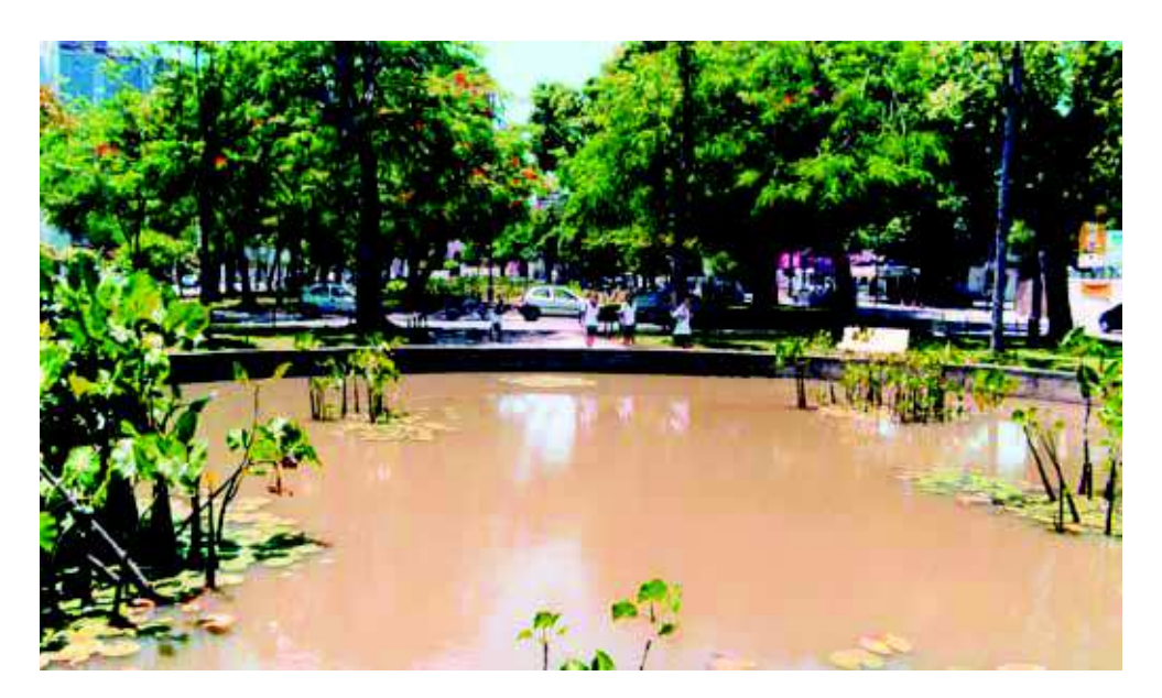
Picture 12 Casa Forte Square, Recife, PE. Photo: Silvio Soares Macedo, 2002. Quapá collection.