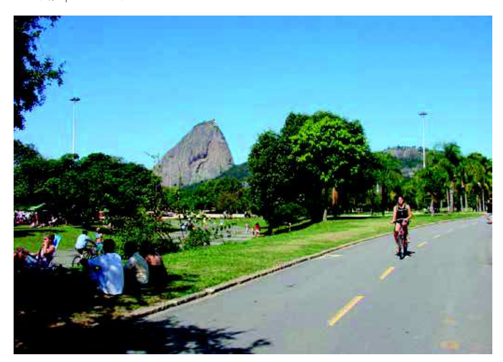
Picture 19 Flamengo Park, Rio de Janeiro, RJ, 2008.