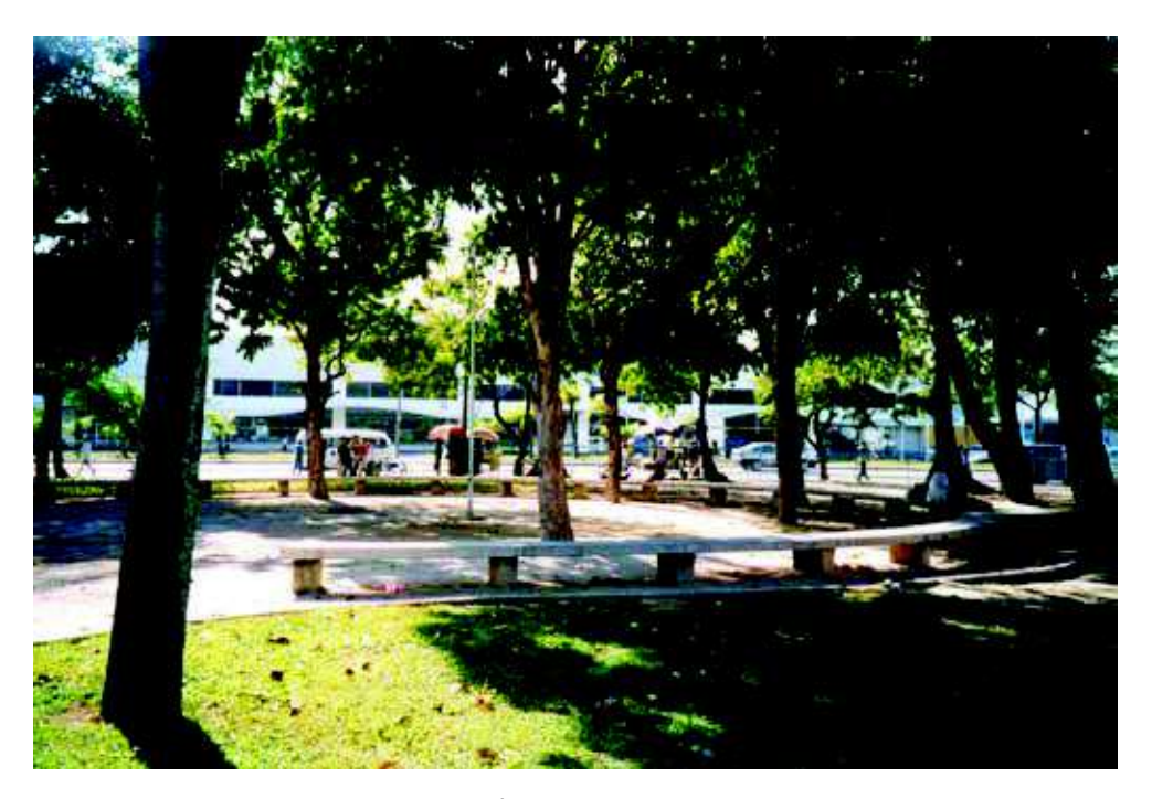
Picture 17 Ministro Salgado Filho Square, Recife, PE. Photo: Silvio Soares Macedo, 2014. Quapá collection.