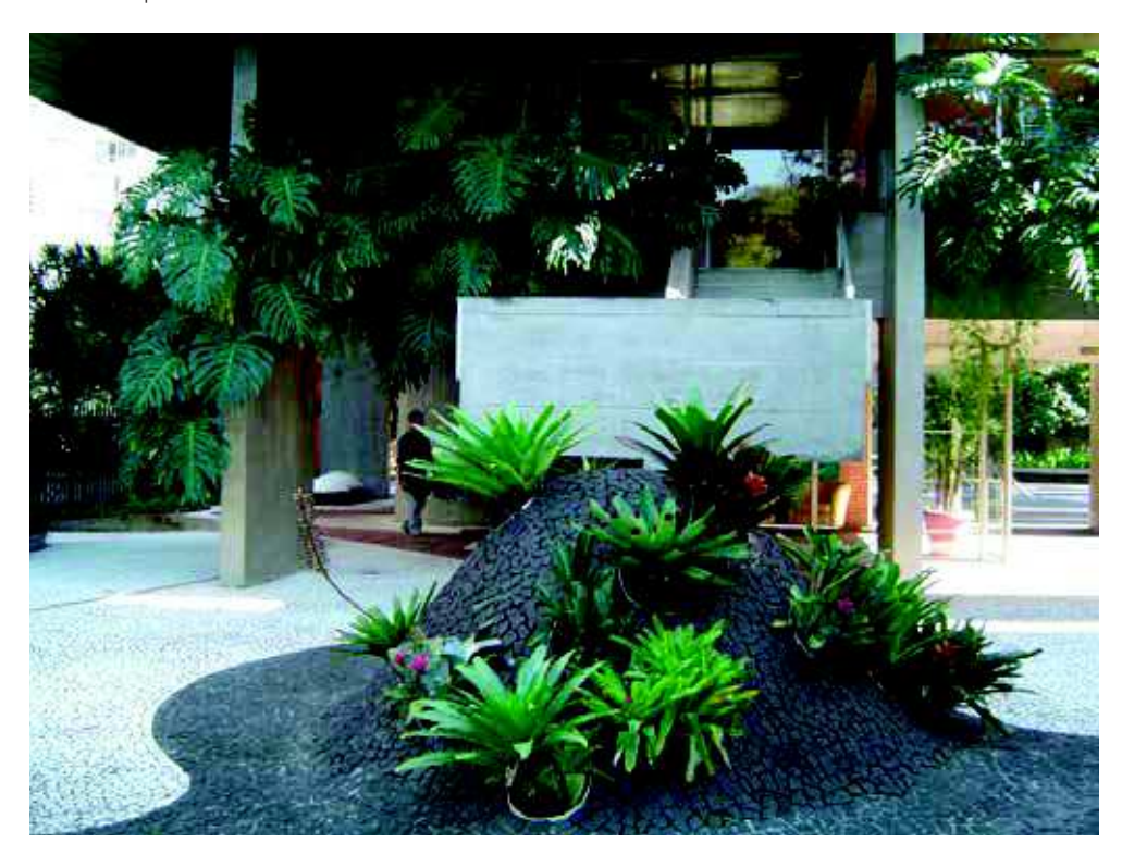
Picture 6 Macunaíma Building, São Paulo, SP, 2005.