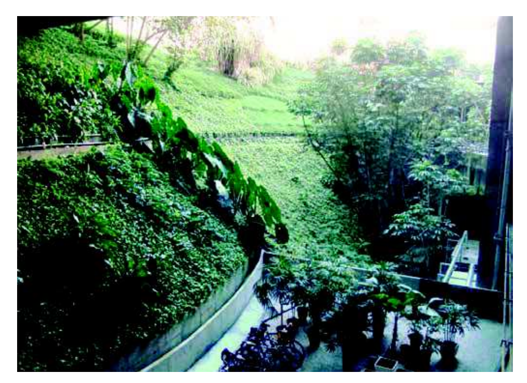
Picture 4 BNDES Building, Rio de Janeiro, RJ, 2010.

Thus, Marx (2004) demonstrated how the juxtaposition of cubist plastic attributes to the natural elements' abstractionism attracted him to new experiences of creating landscapes to be contemplated. In this way, he used the natural topography as the surface for his compositions, giving the elements found in the area the function of plastic organization materials, creating unique projects within a unit, mixing the art of painting with that of the built landscape. Many of his works gently anchored monumental buildings to the topography, harmoniously integrating them into the landscape, as we can see, for example, in the BNDES building project (picture 4).