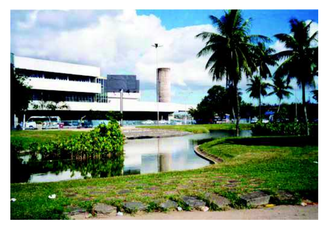
Picture 15 Ministro Salgado Filho Square, Recife, PE. Photo: Silvio Soares Macedo, 2014. Quapá collection.