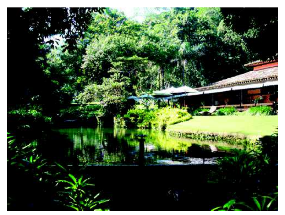
Picture 3 Nininha Magalhães Lins' residence, Rio de Janeiro, RJ, July/2005.