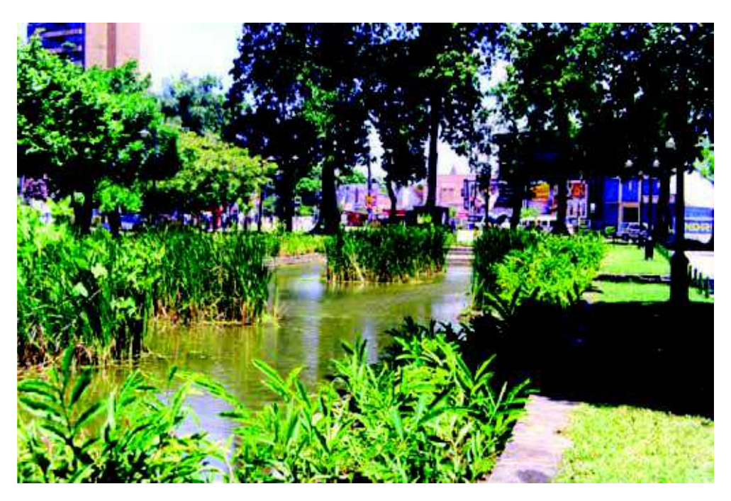
Picture 11 Casa Forte Square, Recife, PE. Photo: Silvio Soares Macedo, 1997. Quapá collection.