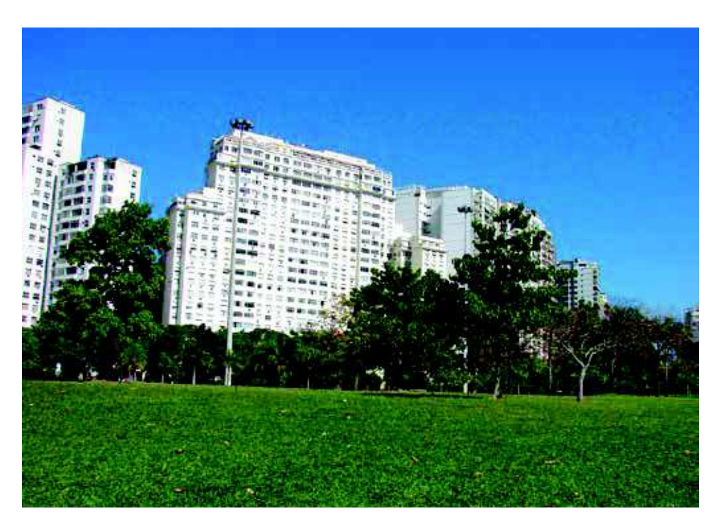
Picture 20 Flamengo Park, Rio de Janeiro, RJ, 2008.