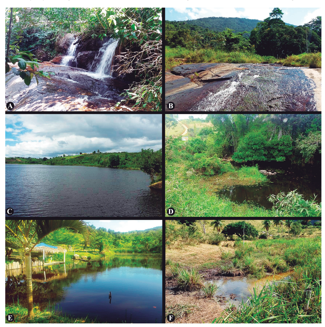
Figure 2. Some sampling sites in the rio da Dona basin. (A) rio Pancada, Serra da Jibóia, in the Mata Atlântica domain; (B) rio Pancada, at the waterfall Cachoeira do Everaldo; (C) reservoir area, with citrus-cultivation on the right margin; (D) stretch downstream from the reservoir; (E) fish-and-pay pool, in the headwaters; (F) tributary silted up through cattle movement, and surrounded by pasture.

Parotocinclus cristatus Garavello 1977. Both species were described from rio Almada basin, southern region of the Bahia State. So far, A. burguerai have been known only from the type locality, Água Boa stream, a tributary of the rio Almada. Parotocinclus cristatus was described from a single locality in the rio Almada, however, the occurrence of this species has been previously expanded to other nearby localities. According to Camelier & Zanata (2014), P. cristatus was found in four drainages from NMAF ecoregion (rio Almada, rio de Contas, rio Cachoeira, and rio Una), being rio Una and rio de Contas the southernmost and northernmost limits of distribution, respectively. Thereby, our result represents a northernmost distribution of the A. burguerai and P. cristatus in the NMAF ecoregion.