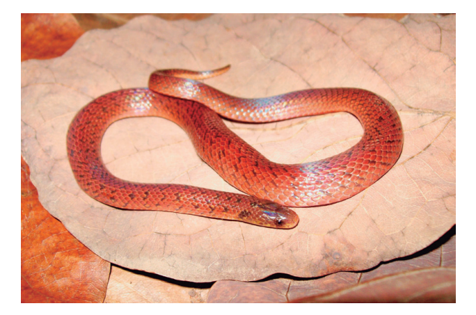
Figure 2. Atractus ronnie at Chapada do Araripe, northeastern Brazil.

log in moist soil (1 in March). Twenty-one snakes were captured in pitfall traps and one individual was found in the stomach of a Bothrops leucurus Wagler, 1824 (Ferreira-Silva et al. 2015) (Table 1).