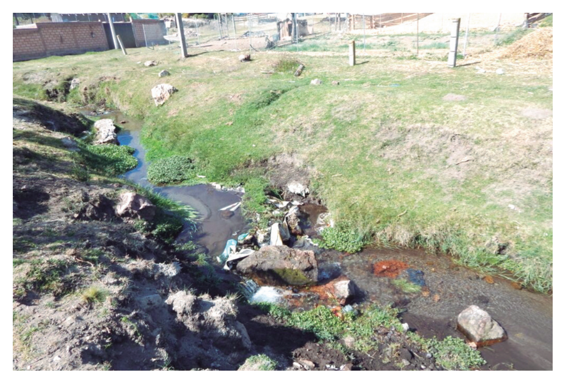
Figure 2. Photograph of example location along the studied stream. Note the presence of trash and refuse in the stream and the proximity to human dwellings.