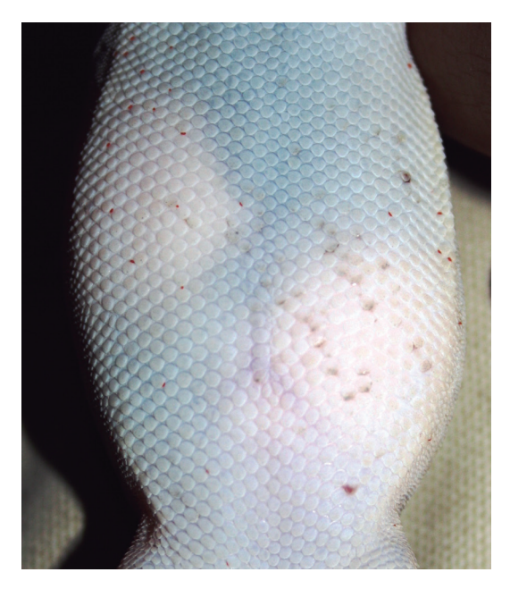
Figure 2. Gravid female of Phyllopezus maranjonensis containing two eggs.

Formerly studied Peruvian populations of Phyllodactylus reissii from Bayovar and Tumbes had a mean SVL of 57.7 \pm 2.7 mm (Huey 1979) and 67.95 \pm 8.01 mm (Jordán 2006), respectively, and voucher specimens of the Natural History Museum of Los Angeles County (LACM) from Amazonas, Cajamarca, Lambayeque, Piura, and Tumbes have a mean SVL of 56.7 \pm 4.7 mm (Goldberg 2007). Thus, the population we studied from the Marañon Region seems to be distinctly larger, with a mean SVL of 74.1 \pm 3.7 mm and 73.6 \pm 4.7 mm for males and females, respectively. These high values might have resulted from the elimination of juveniles from