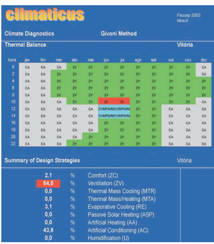
Figure 2 - Design Strategies Climaticus Software

According to Venancio (2010) the use of bioclimatism principles can be grouped into "7 Echoes": eco-efficiency of design, water, energy, natural resources, materials, accessibility and waste. Generally, the higher initial financial cost hinders the implementation of some of these concepts in the elaboration of a project, but the results over the building lifespan generate benefits and investment returns, ranging from real estate appreciation, through low maintenance, plus quality of life and the primordial matter of preserving the environment and natural resources.