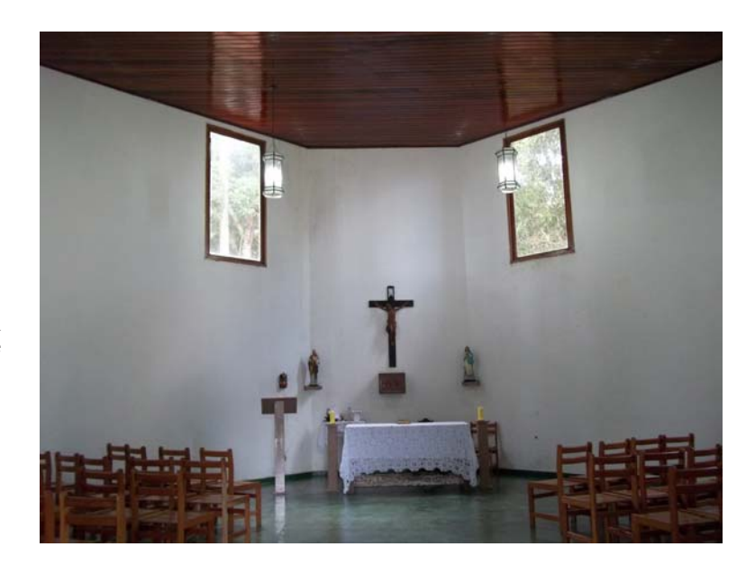
Fig. 5 – View of the altar from the entrance door. Casements and altar leveled in relation to the attendance Photo: Edite Galote Carranza, 2011.

<sup>5</sup> Personal information in interview with José Celso Martinez Corrêa to the author in 2012.