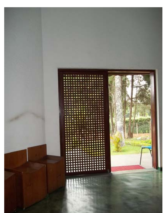
Fig. 2 – Wooden mashrabiya door, wooden benches designed by Lina Bo, and flooring paginated from the wall vertex.

Unlike the other buildings in the Retreat, built with enclosing masonry and overlaid and painted white, with natural aluminum casement and glass, apparent reinforced concrete structure and fiber cement tile roofing, the Chapel is made from reinforced structural concrete block masonry, externally overlaid with cement-and-dirt mortar applied in thin coats.