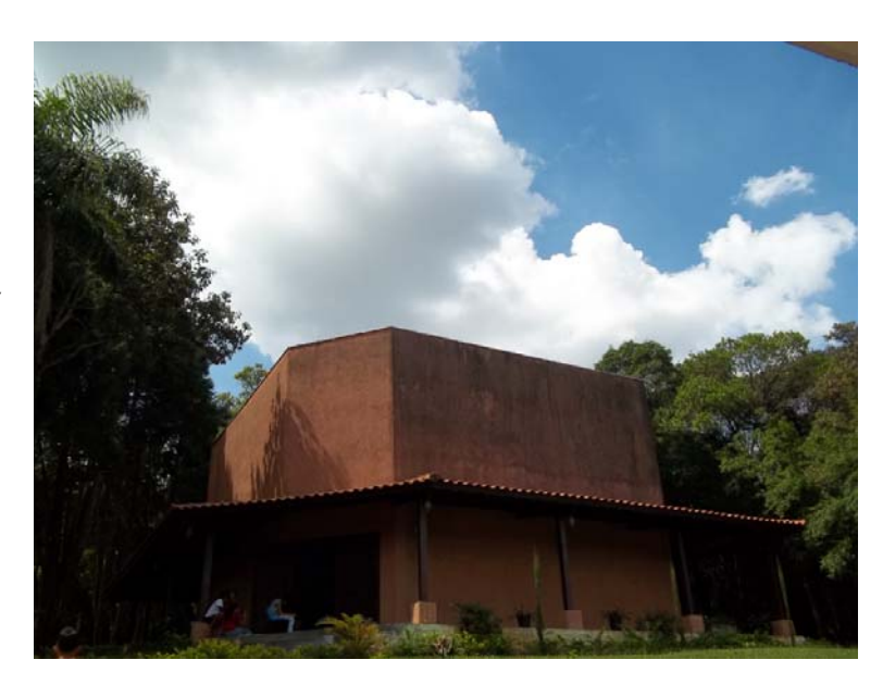
Fig. 6 – Remodeled Chapel Photo: Edite Galote Carranza, 2011.

that, if the Chapel's external shape reflects the architect's reclusion period and could be "read as a metaphor for the dark period the country faces, especially from 1964" (OLIVEIRA, 2006, p.30), the internal space could be equally read as a metaphor for the political opening heading for democracy.