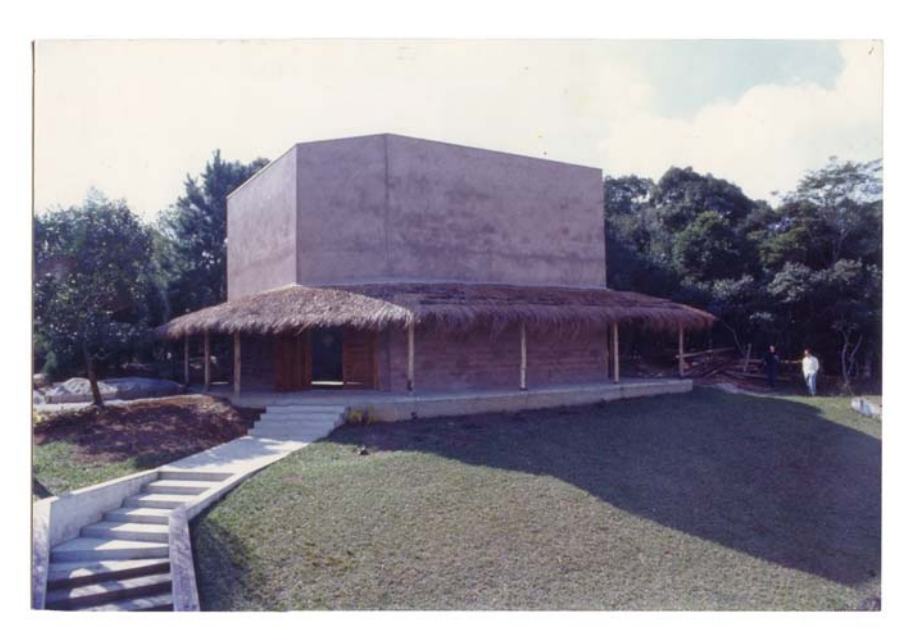
Fig. 1 – Chapel viewed from the Retreat's entrance, recentlybuilt

Unlike the other buildings in the Retreat, built with enclosing masonry and overlaid and painted white, with natural aluminum casement and glass, apparent reinforced concrete structure and fiber cement tile roofing, the Chapel is made from reinforced structural concrete block masonry, externally overlaid with cement-and-dirt mortar applied in thin coats.