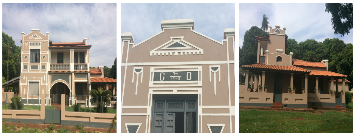
Figure 10: Front and side façade of Triângulo Farm headquarters, Rio Brilhante, Mato Grosso do Sul. Figure 10a: Front façade. Figure 10b: Ornament detail. Figure 10c: Left side façade.