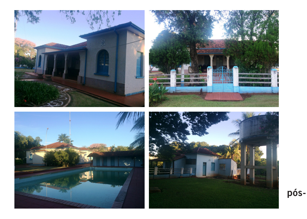
Figure 3: First residence in masonry in Fazenda Bela Vista, Rio Brilhante, Mato Grosso do Sul. Figure 3a: Side view. Figure 3b: Front view. Figure 3c: Back view. Figure 3d: Water box.

Nouveau style. Thus, it has a porch highlighted by colonnade with pillars and embossed details in geometric shapes, which characterizes the Art Déco; in its sidewalk, a Portuguese mosaic-style floor layout.