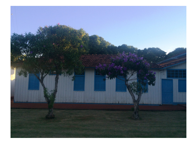
Figure 2: First headquarters in wood in Fazenda Bela Vista, Rio Brilhante, Mato Grosso do Sul.

The headquarters was implanted in a wide terrain, a common characteristic of the Neocolonial style, but surrounded by cement and wood pillars, having an ornamented double-pane access gate made of iron, what recalls the Art