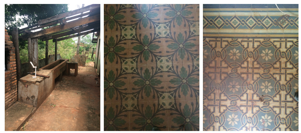
Figure 6: Detail in floor layering and water nozzle of the residence located in Mutum Settlement, Rio Brilhante, Mato Grosso do Sul. Figures 6a: Water nozzle. Figures 6b and 6c: Floor layering detail.