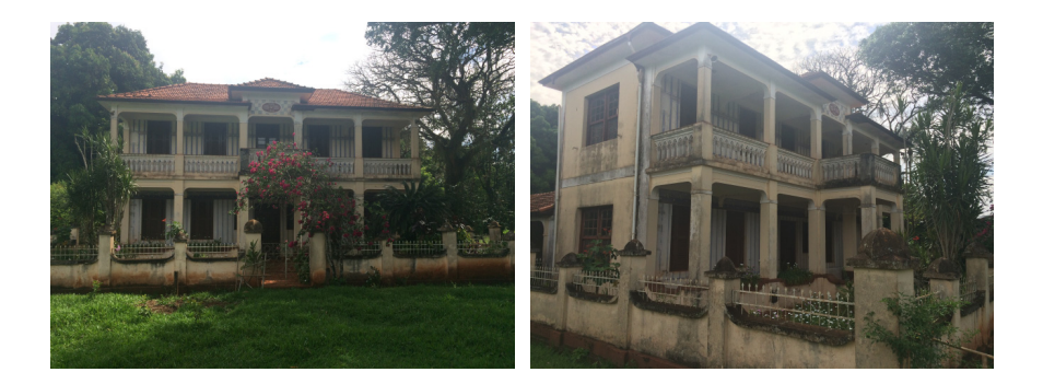
Figure 7: Farm Vira Mão headquarters, Rio Brilhante, Mato Grosso do Sul. Figure 7a: Front façade. Figure 7b: Right side façade.

pedestals and access staircase, masonry in massive bricks, with panels covered with mortar.