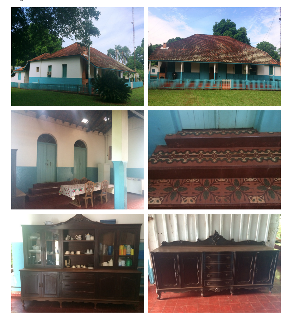
Figure 9: Recreio farm headquarters, with details of the floor tiles layering, and furniture. Rio Brilhante, Mato Grosso do Sul . Figure 9a: Right side façade. Figure 9b: Front façade. Figure 9c: Balcony Interior. Figure 9c: Balcony Interior. Figure 9c: Floor layering. Figure 9e: Furniture – cabinet. Figure 9f: Furniture – sideboard.

The opening of doors and windows are rectangular and arc-shaped, with frames and lids in wood and glass. The covering of the structure is wooden-made, with clay roof tiles, hip roof. The layering of the floor is made with ceramics hydraulic tiles, and furniture carved in wood. Its inspiration was the Neocolonial period (Figure 9).