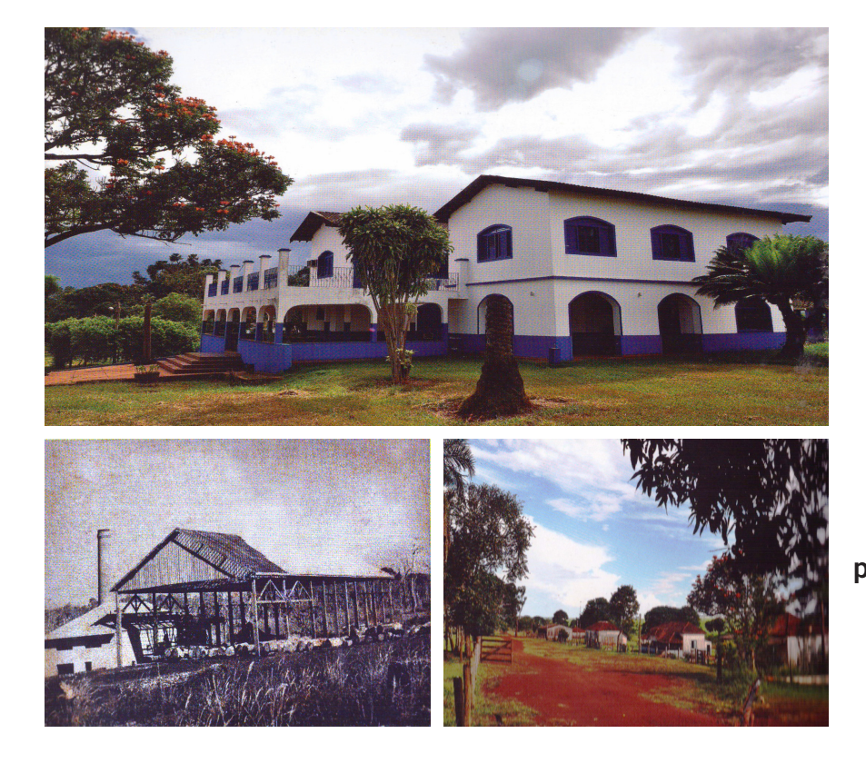
Figure 13: Suez farm headquarters, in masonry, sawmill and wooden houses, Rio Brilhante, Mato Grosso do Sul . Figure 13a: Residence façade. Figure 13b: Sawmill. Figure 13c: Wooden houses.

basement is founded, with an access staircase and porches with arc-shaped openings, masonry in massive bricks, with panels covered with mortar. The opening of the windows is arc-shaped, with lids in iron and glass, just like a shutter. The roof set is two-faced, with wooden structure and clay roof tiles.