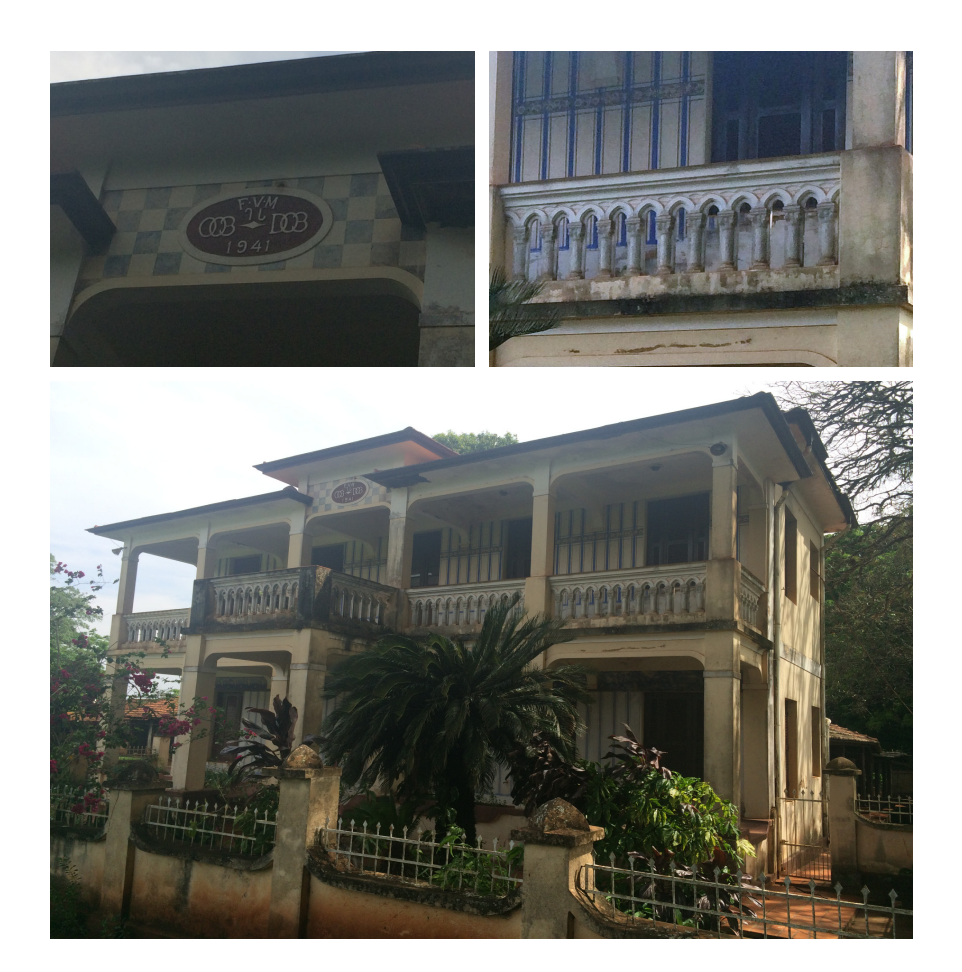
Figure 8: Farm Vira Mão headquarters, Rio Brilhante, Mato Grosso do Sul. Figure 8a: Emblem with the letters. Figure 8b: Balcony detail. Figure 8c: Left side façade.

The covering is apparent, with a wooden structure, and three and four faces, covered by clay roof tiles. It also possessed rectangular openings with lids in wood and glass. Core structure with mainstay, frechal, and knitting of vertical pilasters in flat stem, basement, and capital, besides crowned architrave, frieze and cornice, central pediment and porch with balustrade guardrail in ionian inspiration. Also, it has wallpaper applied on the internal walls of the porch. In its eardrum, applications and ornamentations such as the presence of a medallion, oval-shaped framed with a monogram with intertwined letters "DOB", date of