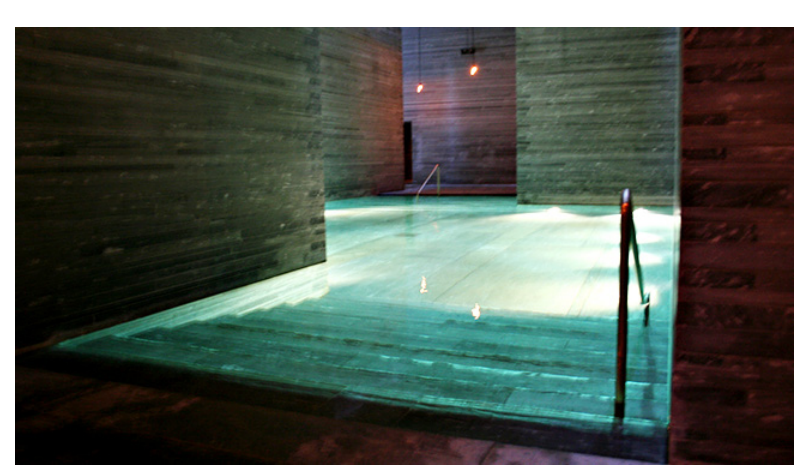
Figure 6: Baths of Vals, Switzerland. Source: Wiki Commons. <a href="https://upload.wikimedia.org/wikipedia/commons/c/cd/">https://upload.wikimedia.org/wikipedia/commons/c/cd/</a> Therme_Vals_indoor_pool%2C_Vals%2C_Graub%C3%BCnden%2C_Switzerland_ -_20071026.jpg>