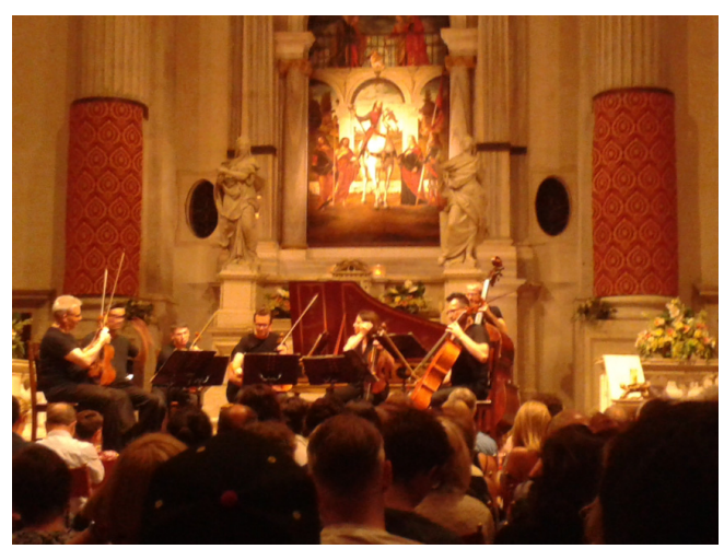
Figure 9: San Vidal, Venice, 17th century.

And if something brings sense of peace, meditation, comfort, warmth , to hear the Four Seasons by Vivaldi on a cold night in the interior of the Church of San Vidal (Figure 9), from the XVII century in Venice, in won't be so only because of their squares meters, but for all the consonance that this magnificent space conveys to us, added to its history, conformation, materiality and time delicately deposited on its walls. A place connected not only with the resonance of sound, their reflections and absorptions, but also in a constant dialectic with all a spatial arrangement that causes the body to merge with available space, a service or even a musical work.