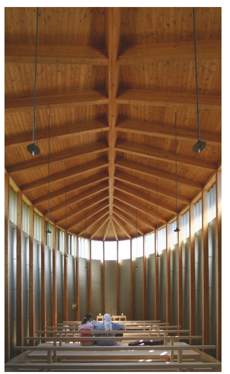
Figure 7: Chapel of San Benedicto, Switzerland.

When analyzing his works, one can verify in the spaces produced by Zumthor all the power with which he carries them.