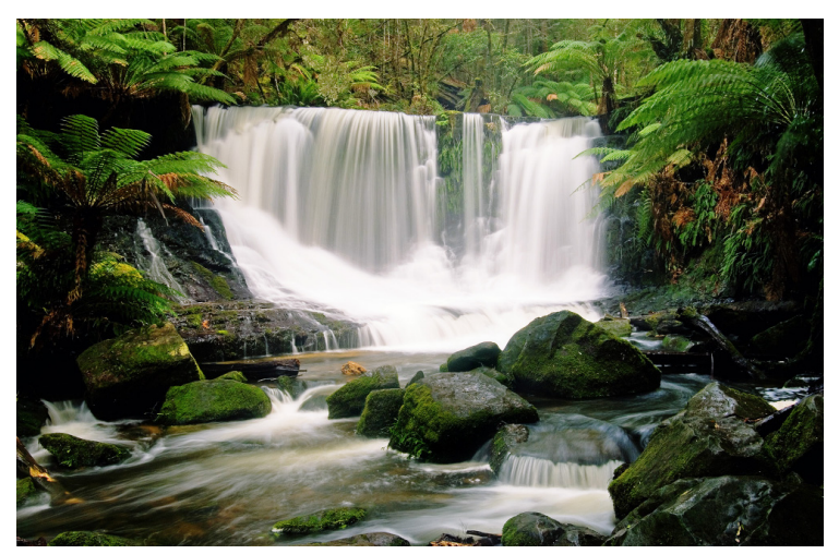
Figure 8: Horseshoe Falls (Tasmania).