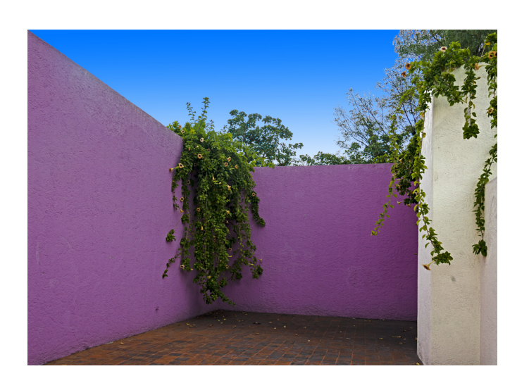
Figure 5: Luis Barragán's Studio House patio, Colonia Daniel Garza, Mexico City.

9 Steen Eiler Rasmussen, 1898 – 1990, Danish Architect and Urban Planner.