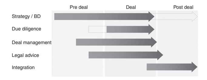
Fig. 1. The deal cycle.

The aim was to investigate the entire deal flow and to understand the correlation between different dialogs, as well as between different viewpoints. The sample was firstly divided