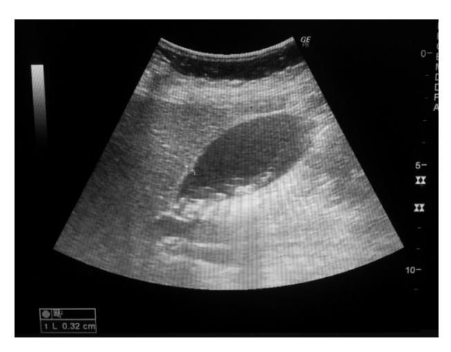
Figure 1. Multiples gallstones demonstrated by an abdominal ultrasound on patient's admission

During hospitalization, the patient had favorable evolution, with improvement of abdominal pain and jaundice, and progressive decrease of liver enzymes levels (Graphic 1). The patient underwent an open cholecystectomy with intraoperative cholangiography which did not show signs of obstruction (Figure 2), with hospital discharge in the day after surgery.