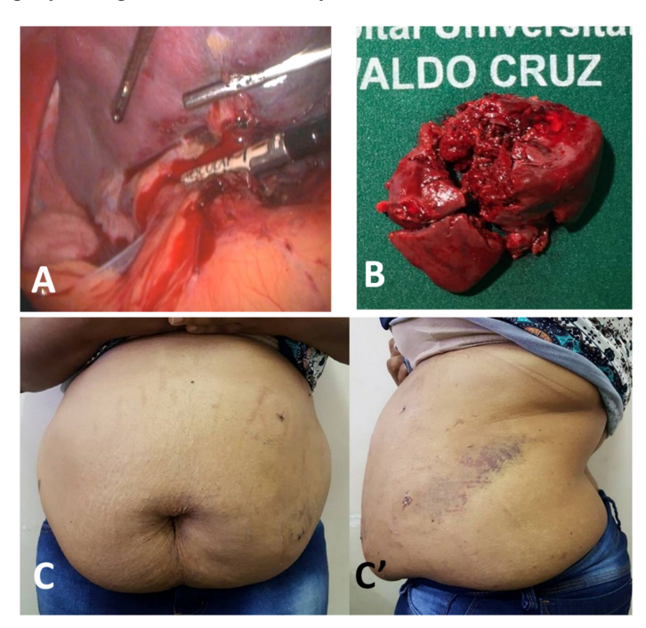
Figure 1. A. Minilaparoscopic instruments for spleen handling and vessel sealing device; B. Surgical specimen showing an enlarged spleen, about 190 cm3, with no signs of malignancy; C and C'. Abdomen at discharge (4th postoperative day) showing minimal scars

The surgery was uneventful, with no further complications, and a total surgical time of 45 minutes. The patient was discharged in good clinical condition, three days following the procedure (Figure 1).