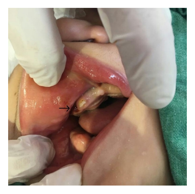
Figure 4 – Image showing the lack of teeth eruptions in almost the entire oral cavity. Arrow showing probable infection gateway, next to the defective tooth eruption in the right maxilla

eruption in the right maxilla (Figure 4). The proposed approach was to continue antibiotic therapy and clean the oral cavity, as surgical procedures were not indicated due to the high risk of hemorrhage.