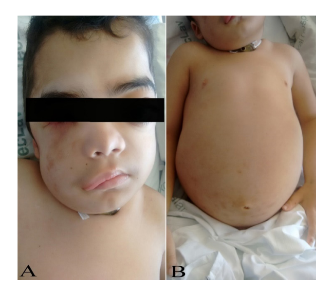
Figure 1 – Findings on physical examination. A) Right facial edema in the maxillary region. B) Hard, globose abdomen with palpable hepatosplenomegaly up to the right iliac fossa

Laboratory tests showed anemia (hemoglobin of 8.1 g/dL), thrombocytopenia (35.390 platelets/mm<sup>3</sup>), lactate dehydrogenase (LDH) of 1071 U/L, alkaline phosphatase of 131 U/L normal renal function and normal electrolytes (Table 1). It was not possible to obtain a precise image of the lung parenchyma on the chest X-ray due to the high bone density in the rib cage (Figure 2).