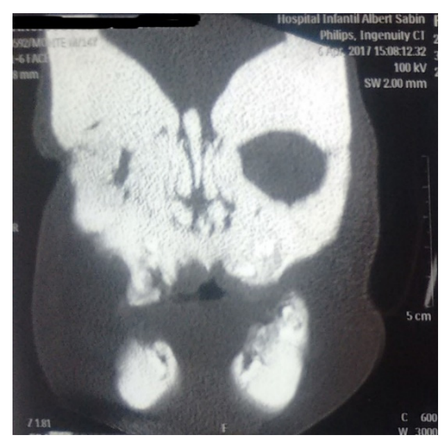
Figure 3 – Contrast-enhanced tomography of the face showing right subcutaneous edema and bone sclerosis in the face

applied for seven days and led to partial improvement of edema and pain.