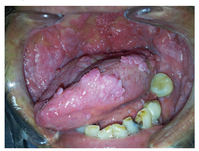
Figure 1 - View of the lateral edge and the dorsum of the tongue showing pedunculated nodules with smooth surface and lighter color than the mucosa.

The intraoral clinical examination detected extensive nodular lesions on the entire oral mucosa (i.e. palate, tongue, mouth floor, and alveolar, jugal and labial mucosa), extending to the oropharyngeal region. The lesions were asymptomatic, whitish and erythematous. The majority of the lesions, like those seen in the palate and tongue, were sessile and had a smooth surface, whereas the others were pedunculated and had papillary projections (Figures 1, 2 and 3).