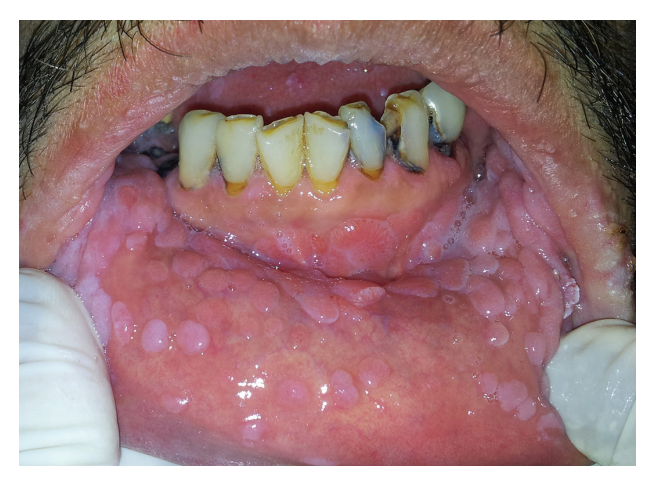
Figure 3 - View of flat lesions with smooth surface on the lower labial mucosa, gingival sulcus.

Incisional biopsy was performed and the material obtained was sent for histopathological examination. The sections were stained with hematoxylin and eosin, revealing a mucosal fragment covered with parakeratinised stratified squamous epithelium and acanthosis areas forming either blunt or sharp projections, giving a papillomatous aspect to the epithelium. At higher magnification, one could observe the formation of micro-abscesses, clusters of neutrophils and diffuse presence of koilocyte-like cells (Figure 4). In addition, a tissue sample was submitted to DNA extraction and analyzed by INNO-Lipa HPV genotyping extra II test (INNO-Lipa Innogenetics N.V., Ghent, Belgium), as well as PCR sequencing with generic primers, revealing the presence of HPV-32.