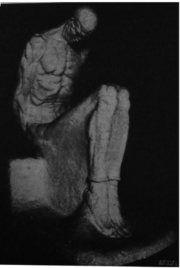
BRECHERET. Eva.