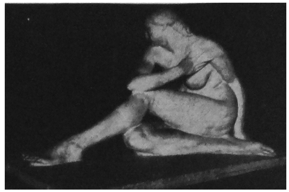
BRECHERET. Eva.