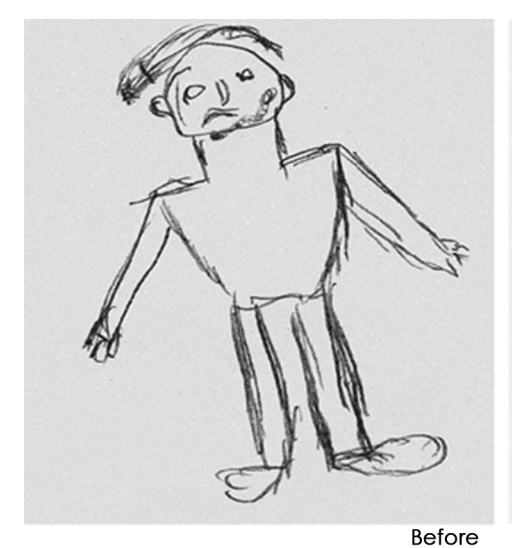
Figure 1. Drawings selected, female

Gender: Female; Diagnosis: Left Hemiplegia, after Ischemic Stroke. Before: Framing: to the left of the sheet of paper, the hand did not fit completely; Head: in profile, parts omitted (nose, pupils, and ears) - may indicate less availability for contact. Dark circles around the eyes are marked, contrasting the image of tiredness with the smile shown by the mouth; Thin neck: fragility in the relation between head and trunk, connection between emotional and rational characteristics; Trunk: triangular, marked by crisscross pattern and buttons - possible withdrawal; Limbs: arms are thin, seem fragile, but are open, available, contrasting with thick legs apparently not too flexible. After: Framing: more centralized; Head: facing forward, pupils are drawn; hair has more volume and is held behind the ear, earrings (more feminine details); Neck: contact between the head and trunk is more direct, different from the previous apparent fragility; Trunk: flowers in the dress with a neckline - more contact with her femininity, in addition to improved self-esteem; Limbs: arms show more movement. Fingernalls (omitted before).