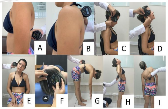
A and B: positions and assessment procedures for cervical and thoracolumbar range of motion; C: cervical flexion; D: cervical extension; E: lateral cervical flexion; F: cervical rotation; G: thoracolumbar flexion; H: thoracolumbar extension; I: lateral thoracolumbar flexion