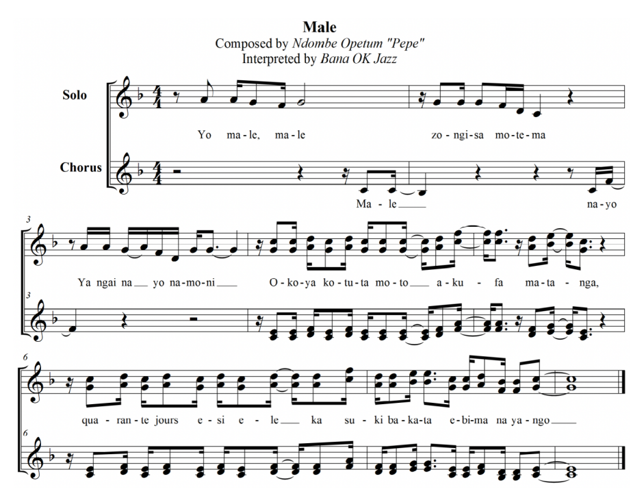
Figure 3 – "Male"