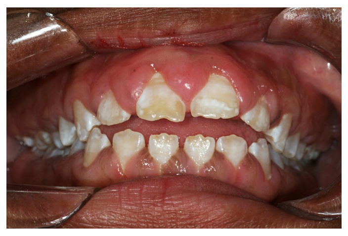
Figure 1. Intraoral examination showing GO in the anterior region of both arches.

Calcium channel blockers act directly on vascular smooth muscle, reducing systemic vascular resistance and improving renal blood flow, thereby reducing the systemic blood pressure.<sup>15</sup> Some studies<sup>11,16,17</sup> showed the incidence of GO ranging between 1.3%