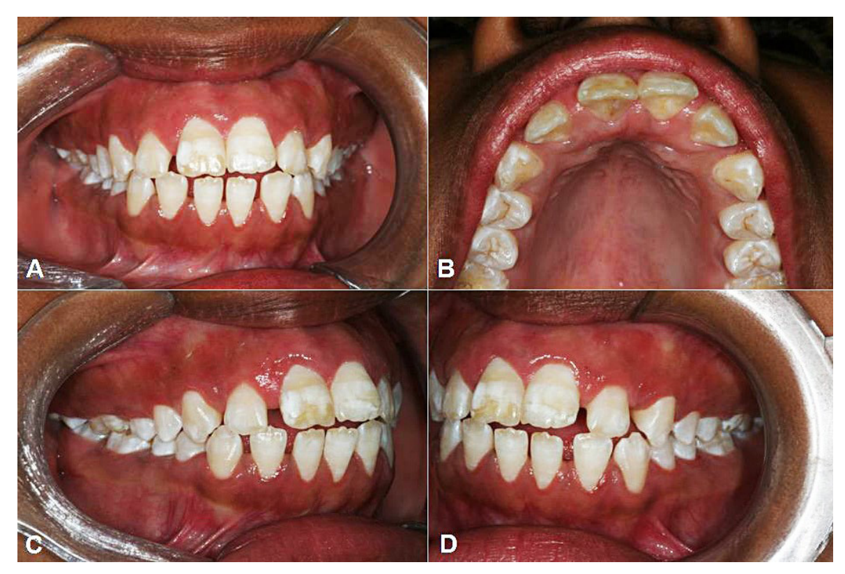
Figure 3. Intraoral examination after 28 months of follow-up, with no recurrence of gingival overgrowth. A - Anterior view; B - Occlusal view; C - Right side view; and D - Left side view.