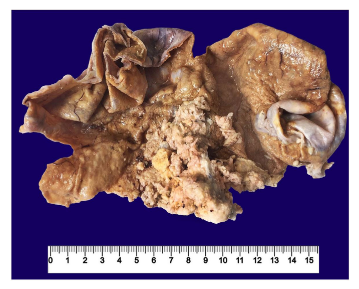
Figure 1. Gross appearance of the specimen after fixation and sampling. Note that most of the internal surface is lined by a smooth surface and in the center of the picture an excrescent and irregular lesion arises, which represents the sebaceous carcinoma.

The left uterine adnexa had no gross nor microscopic alterations.