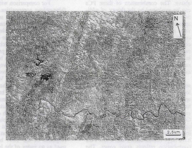
Figure 5 - Image PC4 - differences in the ratio vegetation/exposed rock (light pixels associated to rock outcrops).