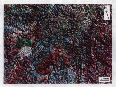
Figure 6 - Triplet TM4TM3TM5 in RGB space.