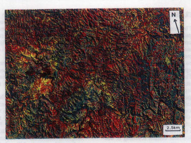
Figure 7 - Triplet PC1PC2PC4 (RGB).