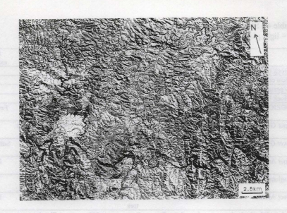
Figure 2 - Image PC1 showing textural aspects of the study area. Note light pixels representing absence or little vegetation, and dark pixels the opposite situation. Further explanations in the text.