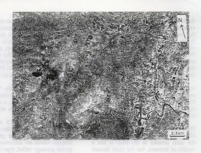
Figure 4 - Ratio TM4/TM3 - vegetation cover ocurrs as light pixels and is very similar to the image of Figure 3 (PC2).