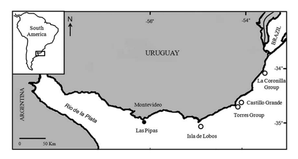
Figure 1. Map of the coast of Uruguay showing all the Pinniped groups of Islands

limit of breeding sites of Southern sea lions in the Atlantic Ocean (VAZ-FERREIRA, 1956). This colony has scarcely ever been counted in the past. In 1953 the birth of 516 pups of O. flavescens was reported, and in 1975 the number of newborn pups had decreased to 100 (VAZ-FERREIRA, 1982). In January 1977 on Isla Verde, only 24 adults and 4 pups were recorded and an "imminent extermination" was mentioned (PILLERI and GIHR, 1977). However in that study, Coronilla islet was not sampled. The last published report on the abundance at the La Coronilla Group was in 1995, when 244 adults and subadults were recorded in Winter and 31 pups in Summer (PONCE DE LEÓN, 2000). Since then no data of abundance of pinnipeds has been recorded, as these islands are not included in the annual population abundance estimations carried out by DINARA. In December 2008, January and April 2009 three counts were made from a boat around Isla Verde and Islote La Coronilla (LEZAMA and SZTEREN, 2009) where 93, 136 and 82 animals were counted respectively; 20 pups were observed in January and 11 in April. Nevertheless, the contribution of this area to the total sea lion population is still uncertain.