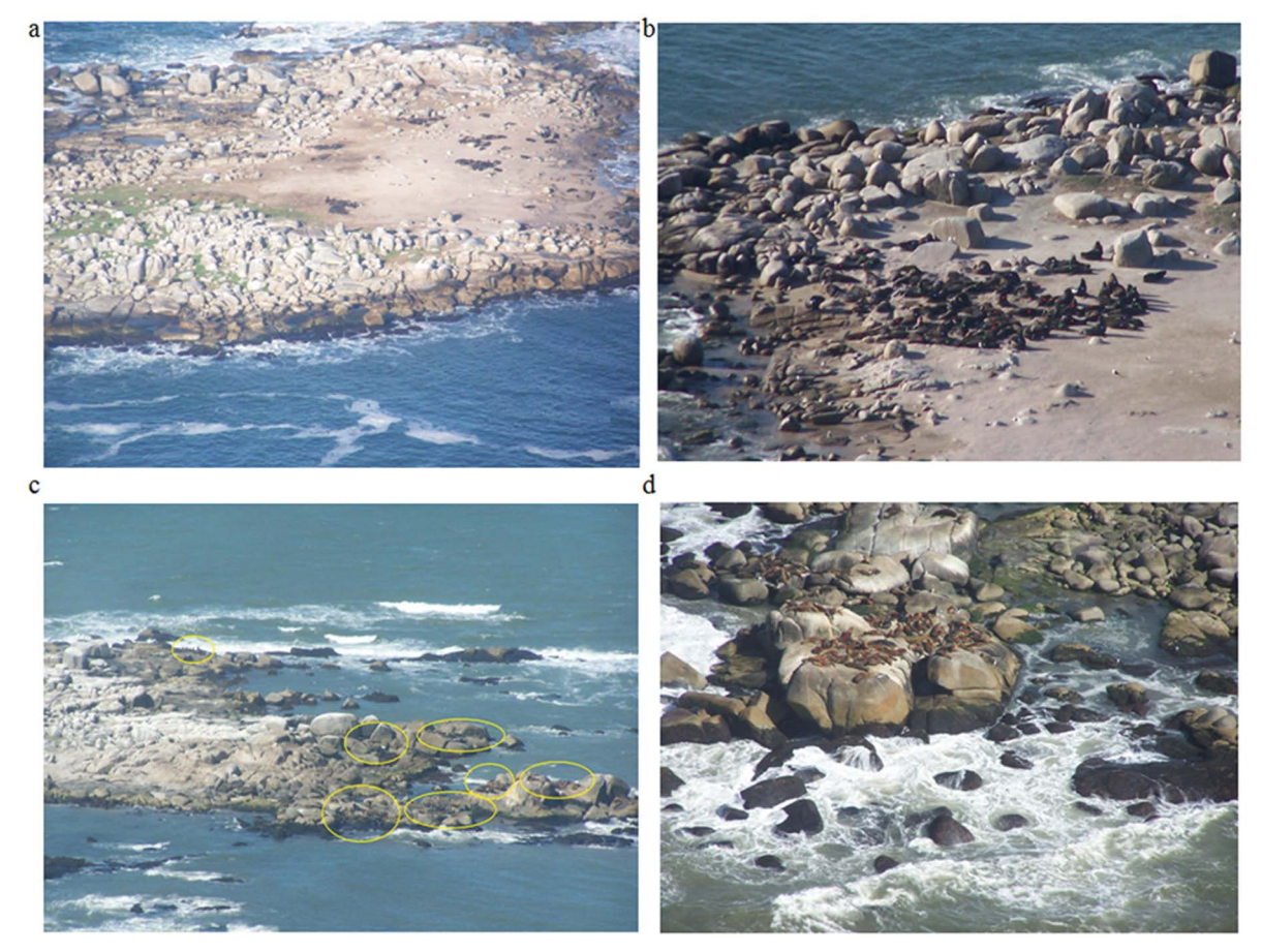
Figure 4. Localization of some sea lion groups a) dispersed on the beach, in June 2008; b) on the beach, more concentrated and near the sea in September 2008. c) on the rocks, in November 2008.

age categories is similar to the structure typical of other breeding areas (CRESPO and PEDRAZA, 1991; DANS et al., 1996; ACEVEDO et al., 2003; SEPÚLVEDA et al., 2011). I propose it could correspond to a colony with low breeding activity. It is important to note that this structure differs from that found in 1995 (PONCE DE LEÓN, 2000), where in Winter it was a haul-out site for sub-adults and adult males and in Summer there were females and pups, which would migrate afterwards to other Winter haul-outs.