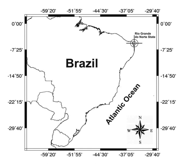
Figure 1. Sampling area: Rio Grande do Norte State, Brazil.