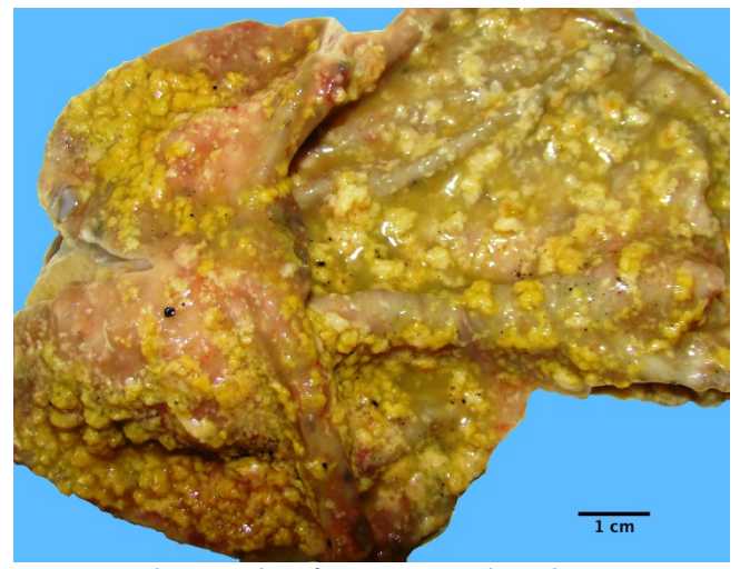
Figure 1 – Photography of cecum (juvenile male). Note severe necrosis and with mucosa detachment

<u>Necropsy</u>: In the five animals, the necropsy findings were similar, especially in the intestinal tract, where severe coalescing necrotic enteritis was diagnosed with greater severity in colon and cecum (Figure 1).