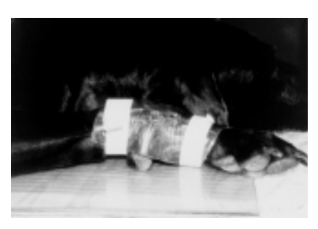
Figure 2 Illustration of the radiation field in the teletherapy (bolus use).