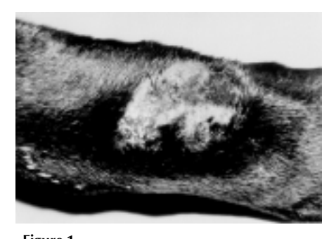
Figure 1 Illustration of the lesion before the treatment