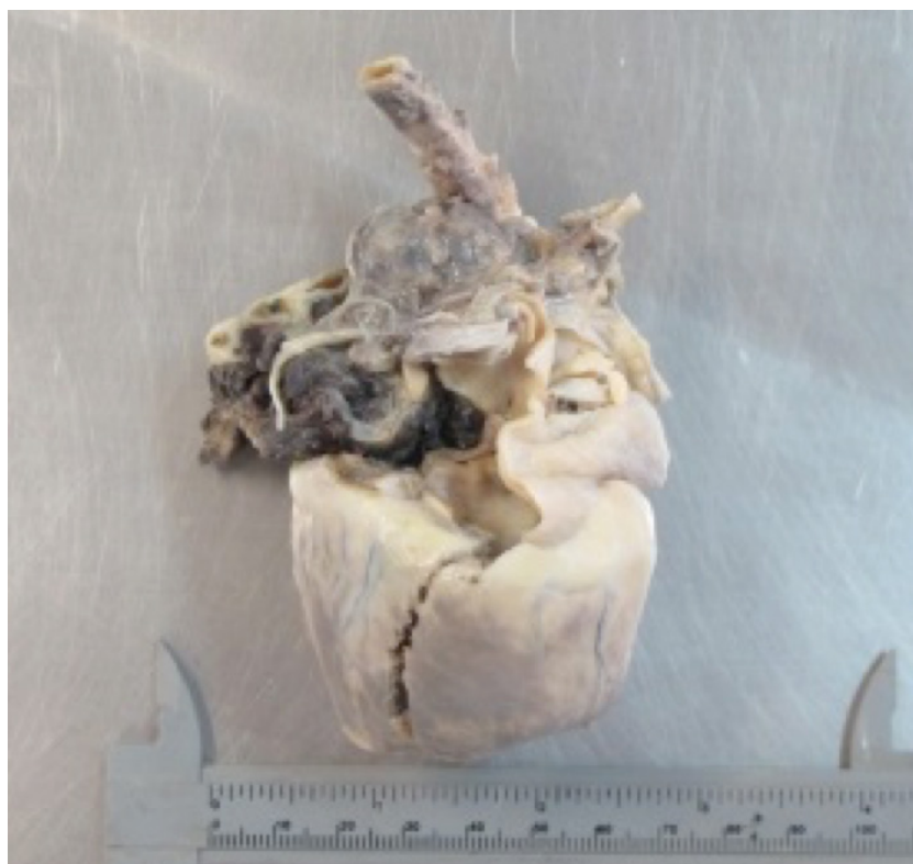
Figure 3 – Neoplastic mass in left atrium base, involving aorta and pulmonary arteries