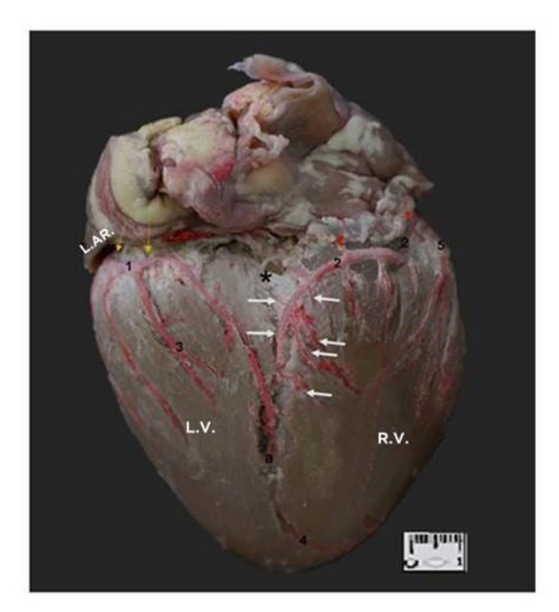
Figure 3 – Macro photography of the atrial face of a heart of Sus scrofa . Left auricle (L.AR.); 1 left circumflex branch; crux cordis (*); 2 right circumflex branch; 3 left marginal branch; subsinuous interventricular groove (a); 4 paraconal interventricular branch; septal branches of the subsinuous interventricular branch (white arrows); atrial branches of the left circumflex branch (yellow arrows); atrial branches of the right circumflex branch (red arrows); right (R.V.) and left (L.V.) ventricles

The right coronary artery stretched between the pulmonary trunk artery and the right auricle as far as the coronary groove to ramify throughout the auricular and atrial faces after the formation of the marginal branches of the right coronary artery, the circumflex branch of the right coronary artery and the subsinuous interventricular branch of the right coronary artery. Once on the atrial face, the artery produced to the right ventricle in 84% of the hearts of both sexes, the branch of the coronary artery to the conus arteriosus . The short marginal branch of the right coronary artery has been identified in all of the hearts of boars (Figure 3).