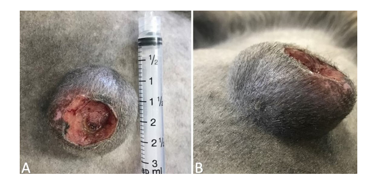
Figure 1 – Well-circumscribed mass located on the left scapular region, well-defined margins and presence of ulceration at the center. (A) The size of the cutaneous mass was determined by measuring the neoplasm with the scale (calibration markings) printed on the barrel of a 3 ml syringe. (B) Lateral views of the neoplastic nodule.

The tumor mass was surgically removed twenty days after cytological exam. The anesthetic premedication was done with Tramadol hydrochloride (3 mg/kg, subcutaneous), Midazolam (0.25 mg/kg, intramuscular) and Ketamine (5 mg/kg intramuscular). Venous access was performed, and Propofol (2.5 mg/kg) was used for induction. After intubation, anesthetic maintenance was established with Isoflurane and oxygen in a semi-open Baraka circuit. The incision was performed in horizontal ellipse around the neoplastic mass with a safety surgical margin of approximately 0.5 cm Tumor adhesions were not observed during the surgical procedure. The subcutaneous tissue was suture with absorbable, synthetic, multifilament, 3-0 polyglycolic acid