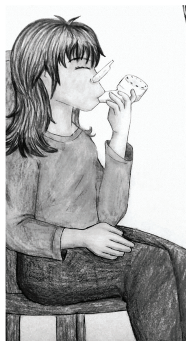
Figure 2 - Illustrative image showing a patient performing oscillating positive expiratory pressure therapy for 5 min in a sitting position.

All samples were processed according to the previously published protocol (18). Briefly, sputum was separated from