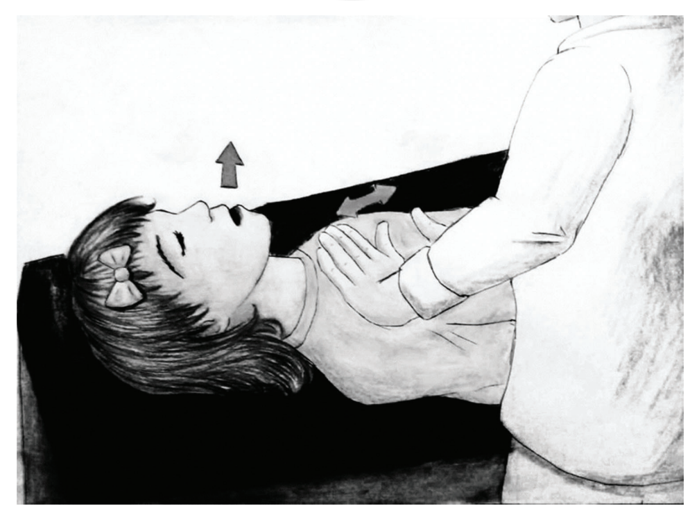
Figure 3 - Illustrative image demonstrating the forced expiration (huffing) technique associated with accelerated expiratory flow. The therapist places one hand on the patient's manubrium and the other hand on the xiphoid process of the patient's sternum. Thereafter, the therapist brings the two hands together during the patient's exhalation, accelerating the outflow of air, while the patient simultaneously exhales with the glottis and mouth open, and the abdominal muscles contracted.

processing time <2h, squamous cells \le 80\% , and at least 200 inflammatory cells per technique (15).