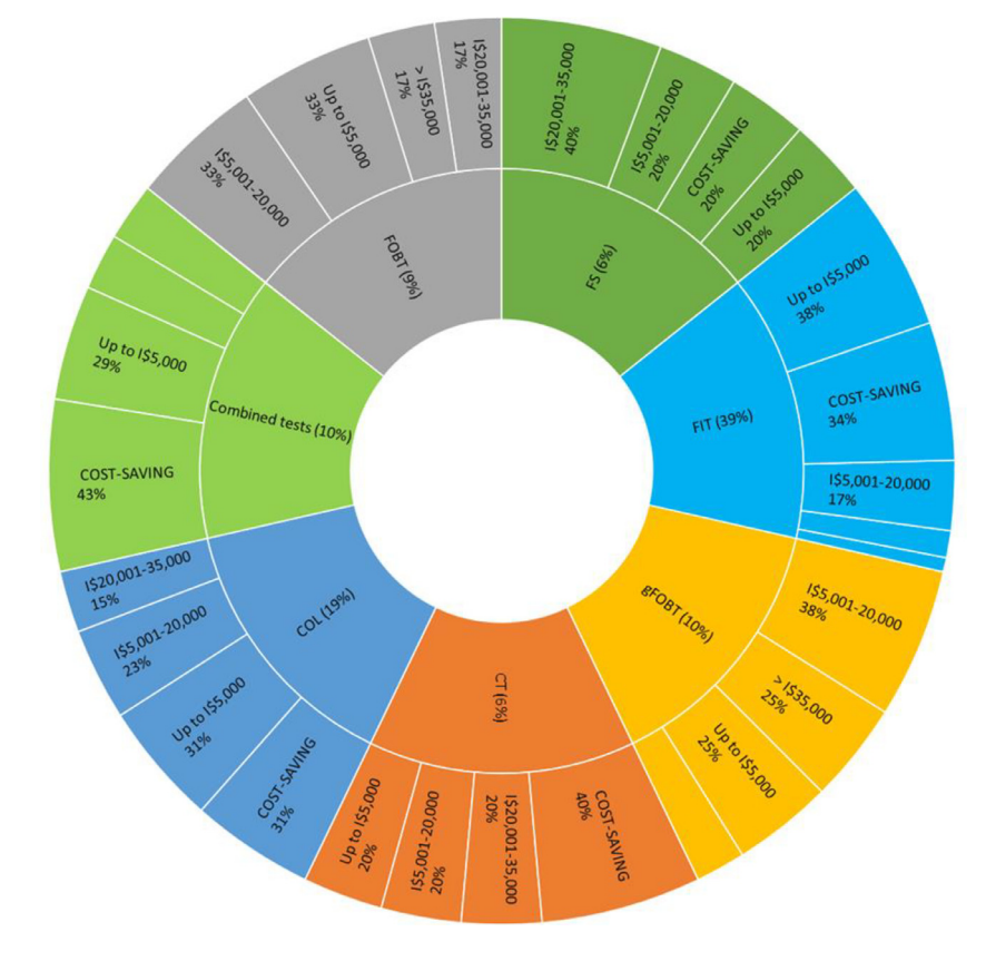
Fig. 2. Colorectal cancer screening Incremental Cost-Effectiveness Ratios (ICERs) results. COL, Colonoscopy; CT, Computed Tomography; FIT, Fecal Immunochemical Test; FOBT, Fecal Occult Blood Test; FS, Flexible Sigmoidoscopy; Combined tests (When more than one type of test was used). *All ICERs were adjusted by local inflation to 2020 and then converted in International dollars (I$) using the Organization for Economic Cooperation and Development (OECD) Purchasing Power Parity conversion rates.

In addition, CRC screening was demonstrated to be cost-saving in 21% of economic evaluations, meaning that the screening program in the average-risk population would be more effective and less expensive