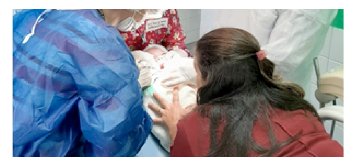
FIGURE 2 Procedure under local anesthesia. Multidisciplinary team, and patient under physical restraint with the Pedi-wrap.