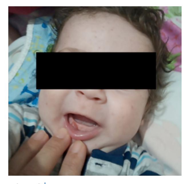
FIGURE 1 The lesion's initial aspect. A pedunculated soft nodular lesion of approximately 1 cm in the lower lip.

Cryosurgery was performed under local anesthesia, and 4 30-second cycles of liquid nitrogen were applied until the lesion was totally frozen. After the procedure, the lesion healed. It, however, relapsed after two months.