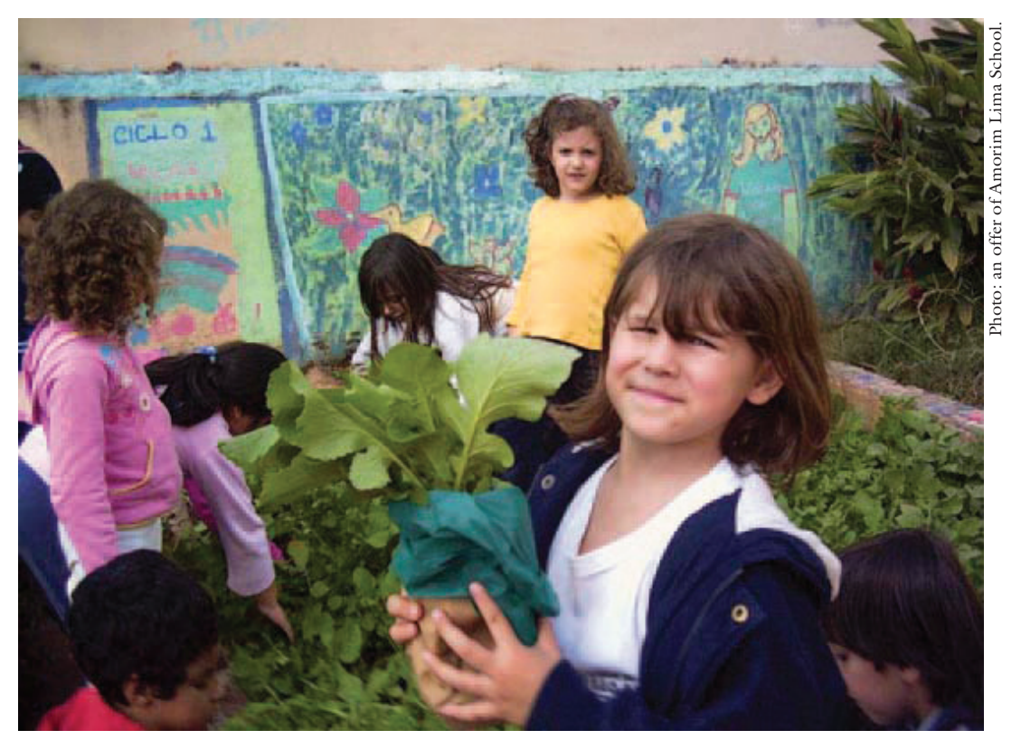
Young students plant and harvest vegetables in Amorim Lima School's vegetable garden.

person who comes to the party must place a wish written on sheets of handcrafted paper produced by the group of Nature Watchers.