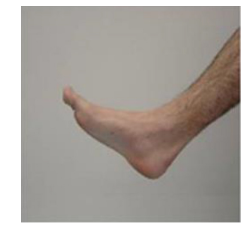
Figure 2. Example of image shown for identification

The MI group, at the end of each treatment, was taken to a room attached to the physiotherapy department where each participant sat in front of a computer, in a calm environment, without external disturbance or assistance from others. On the computer screen, 40 different ankle-foot images were randomly projected (20 left and 20 right), in different angles and with different ankle-foot positions (Figure 2). The participant was asked to press the right arrow or the left arrow of the computer keyboard when he was able to identify the image of the foot to be the right or left limb. The right arrow should be pressed when the participant identifies a right foot and the left arrow when he identifies a left foot. The maximum time that the image remained projected on the screen was 4 seconds, after which the image changed, should the participant fail to identify it. Before the MI exercise, participants received explanations on the use of the program, and were shown some images of the ankles, from the right and left foot. At the end of the 40 images, the software specified the time used to identify each foot and the number of right guesses<sup>12</sup>.