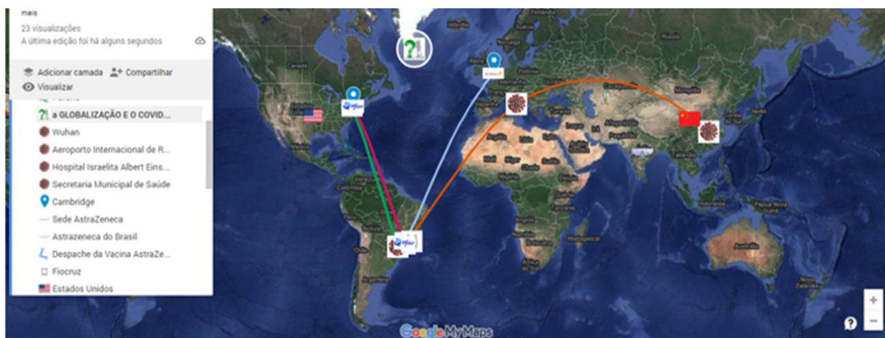
Figure 3 – Partial reproduction of the map produced by group 8 of third-year high school students from a school located in the interior of the state of Paraná