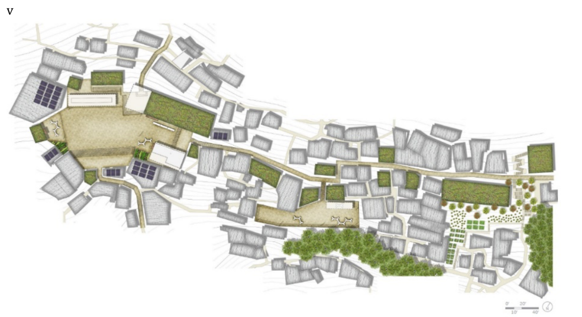
Figure 3. Urban corridor intervention.