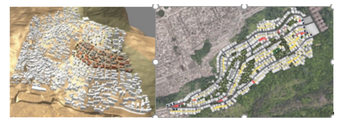
Figure 4. (left) Student proposal to expand the Santa Marta favela to the east.