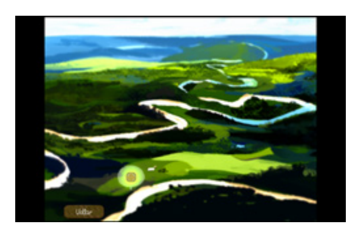
figure 4 Level selection screen, Rio Jordão (Illustration: Talita Hayata).

One of the main mechanics of the game consists in controlling two yuxin , beru yuxin (iris yuxin ) and yuda baka yuxin (body of flesh and bone yuxin ), which act differently in the world, as shown by Els Lagrou: