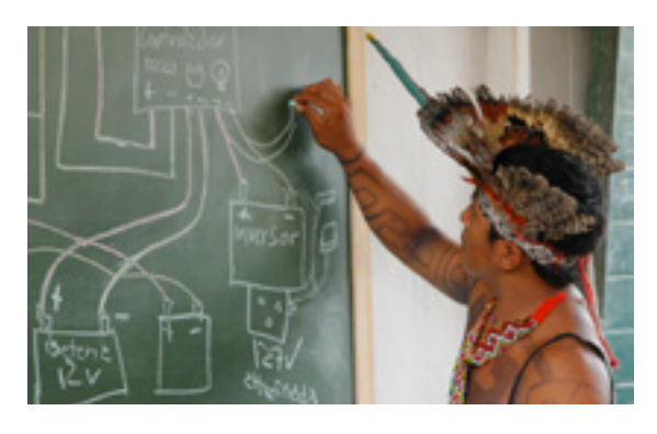
figure 6 Maintenance of solar energy systems' workshop (Photo: Nadja Marin, 2015).

Due to the weather and resources, and analyzing the proportions of the region, the seven central villages<sup>29</sup> were chosen: Novo Segredo <sup>30</sup> (group 1), Três Fazendas (group 2), Novo Natal (group 3), Boavista (group 4), Astro Luminoso (group 5), São Joaquim / Memories Center (group 6) and Lago Lindo (group 7). The village Coração da Floresta , led by the pajé Dua Busẽ, was also benefited. Where there were already culture points (from the Ministry of Culture via Rede Povos da Floresta ), cases of the villages Novo Segredo , Três Fazendas and São Joaquim , it was up to our team to restore them (installing new batteries, replacing burned charge controllers and power inverters), equipment (cameras, notebooks, projectors and recorders) and install previously non-existent<sup>31</sup> lighting channels. Where there was no culture point, the effort was to inaugurate initial versions, installing in each village a basic solar energy system, with solar panels, batteries, controllers, inverters; as well as the illumination of houses.