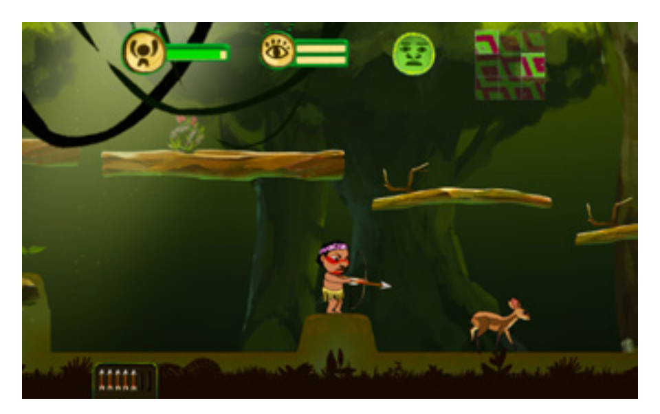
figure 3 Game screen (Illustration: Talita Hayata).

Huni Kuin: Yube Baitana works on computers running Windows or Mac OS (both desktops and notebooks, but not on mobile devices such as mobile phones and tablets). It has a mouse and a keyboard (optional joystick) as controls. To play its necessary to walk with the character (forwards and backwards), jump on platforms and obstacles, pick up items like food, medicines and pieces of drawings [kene]; escape from thorns and thornbushes; jump over holes and wooden trunks; hunt tapirs [awa], pacas [anu], deer [txashu], wild pigs [yawa] and birds [isku], shoot arrows [txara], beat with the club [binu] and hurl the spear [haxī], among other movements and confrontations with special characters.