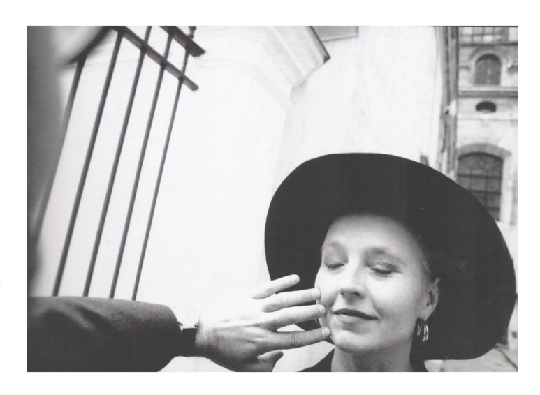
IMAGE 10 Evgen Bavcar, untitled. From the "Portraits" Series (Bavcar 2003a).

However, I believe that we fool ourselves by limiting Bavcar's act of closing his eyes to a mise en scène of a transcendental gaze taken as above reality. This is rather, like the shadows found in Duchamp's work, an expression of the intractable reality that, as such, always remains invisible. Bavcar's gesture invites us to do the same. To close our eyes against his own image and letting it reclaim our virtual images to develop with them new ways to see the world. The closed eyes, therefore, set in motion an Imaginary about the different ways to face an image. This gesture reappears in other photograph present in the book Memórias do Brasil under the title of the portraits series.