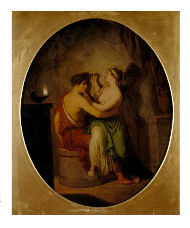
IMAGE 3 David Allan Scottish – The origin of painting (The maid of Corinth) 1775.<sup>13</sup>