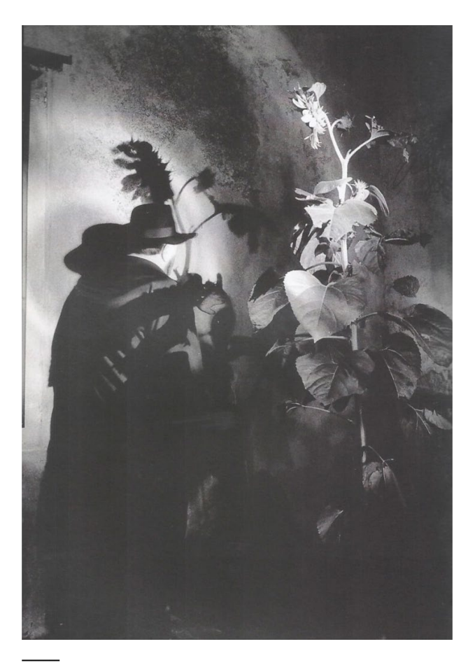
IMAGE 2 Evgen Bavcar, untitled. From the "Self-portraits" series (Bavcar 2003a).

12. The syncategoremata is used by Krauss (2002) to reflect on the movements of André Breton who, after a night of walkabouts in Paris, decides to recite fragments of the poem Tournesol , written ten years before. He realized that the poem not only described the same path he had taken, but that it also had several analogies between what had been written years before and the meeting that happens at the night. The poet then goes further in his analyses and puts himself as the subject and the poem as a manifestation of his unconscious mind. He then designates a movement that goes in two directions, towards both past and future, where he places himself as the field where associations between the poem, the path and the events become meaningful.