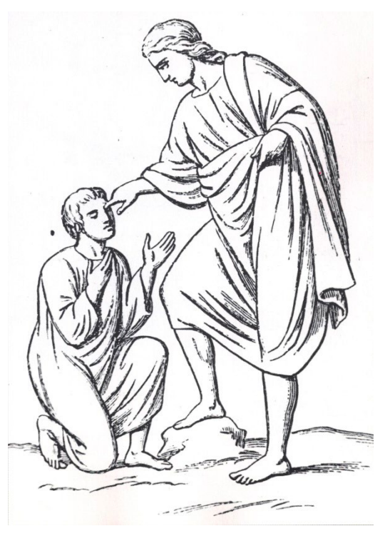
IMAGE 13 "The healing of the blind", Catacombs of Domitilla (Barash 2001).

In Bavcar's portrait, we see neither a sacred figure giving back a blind man his vision, which would not be a witness to a divine power, nor a violent act afflicted in someone's eyes. We rather see a blind man himself using his "palpable gaze" to "cure" the "non-blind" blindness, closing their eyes to the immediate vision and eliciting them to see the potency of what remains invisible.<sup>20</sup>