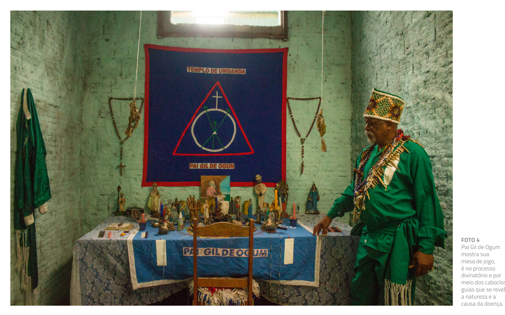
FOTO 4 Pai Gil de Ogum mostra sua mesa de jogo, é no processo divinatório e por meio dos caboclos guias que se revela a natureza e a